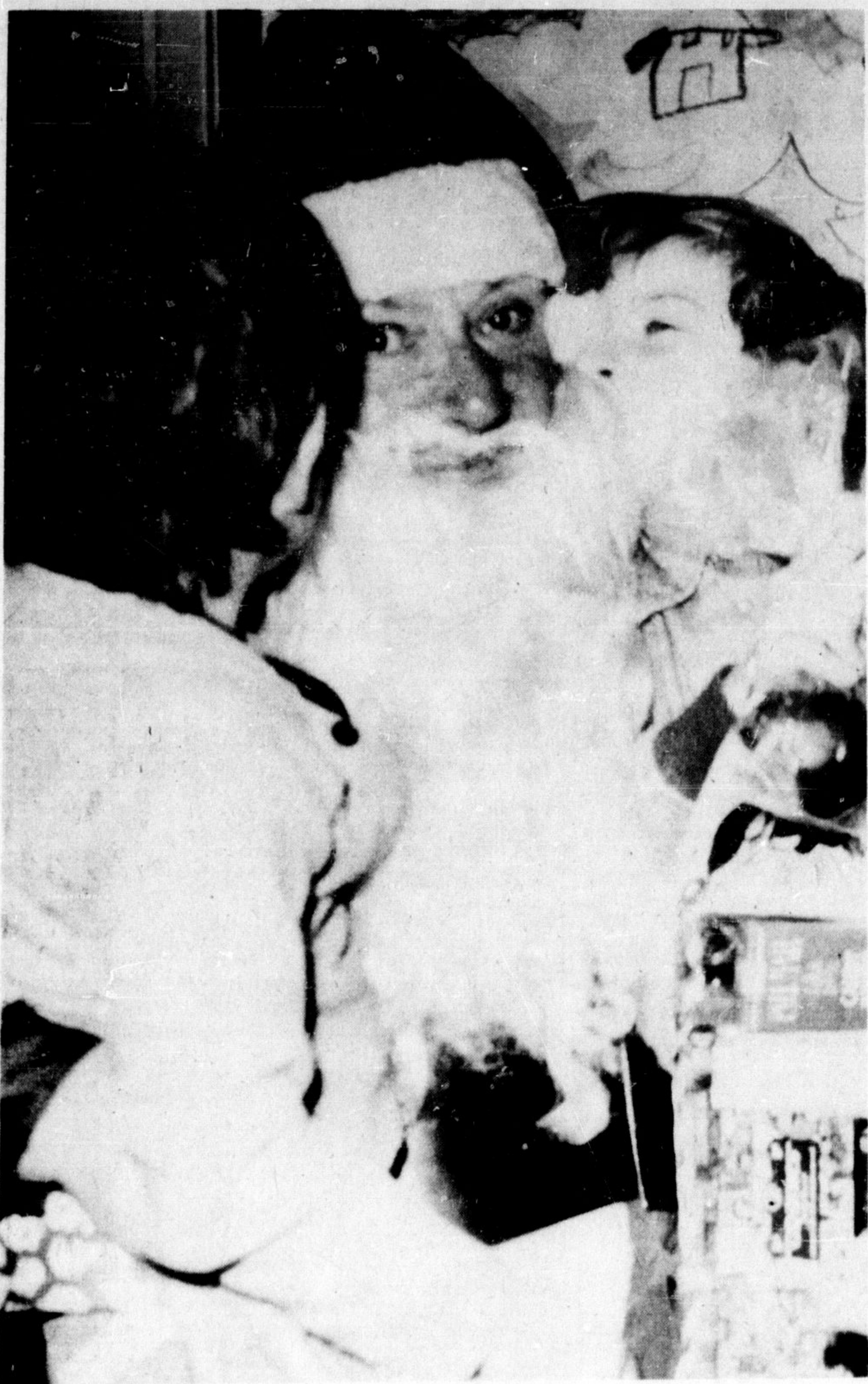
SANTA DELIGHTED the children at the Sunshine School for Trainable Retarded last week. Here two of the students thank Santa with a kiss as they clutch their stockings of fruit and candy.