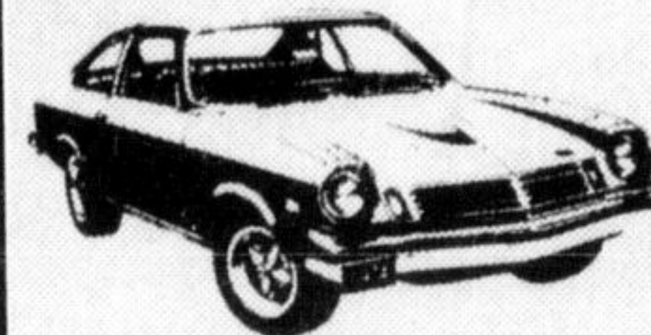
Vega GT Hatchback Coupe

• OLDSMOBILE • VEGA • MONTE CARLO • CORVETTE • NOVA • CAMARO • CHEVELLE • WAGONS • CHEV TRUCKS