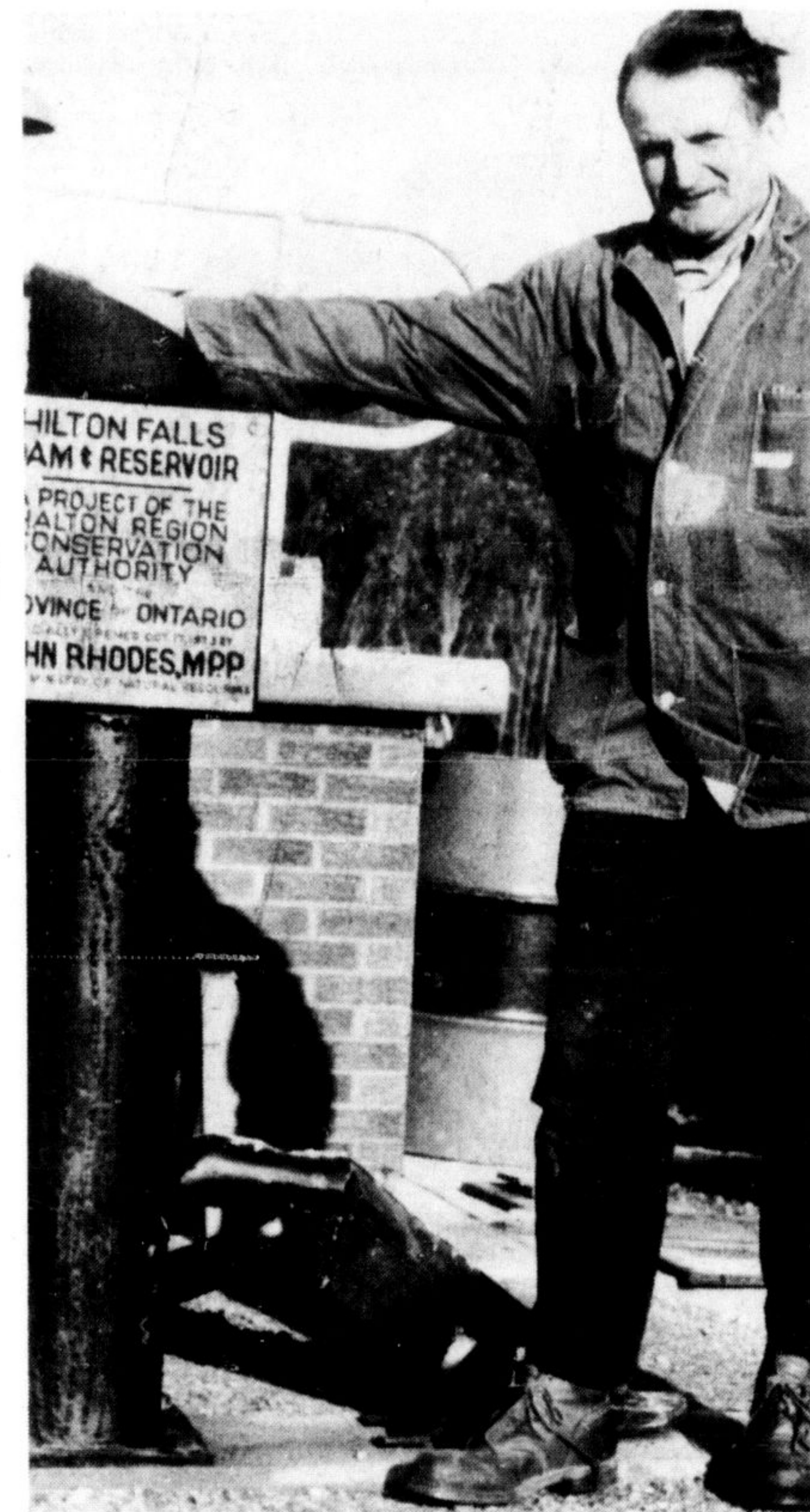
A BEAVER GNAWING AT A TREE is just one of the sculptures made by Casey Bakema for HRCA. It holds the announcement of the Hilton Falls Dam and Reservoir official opening in October.