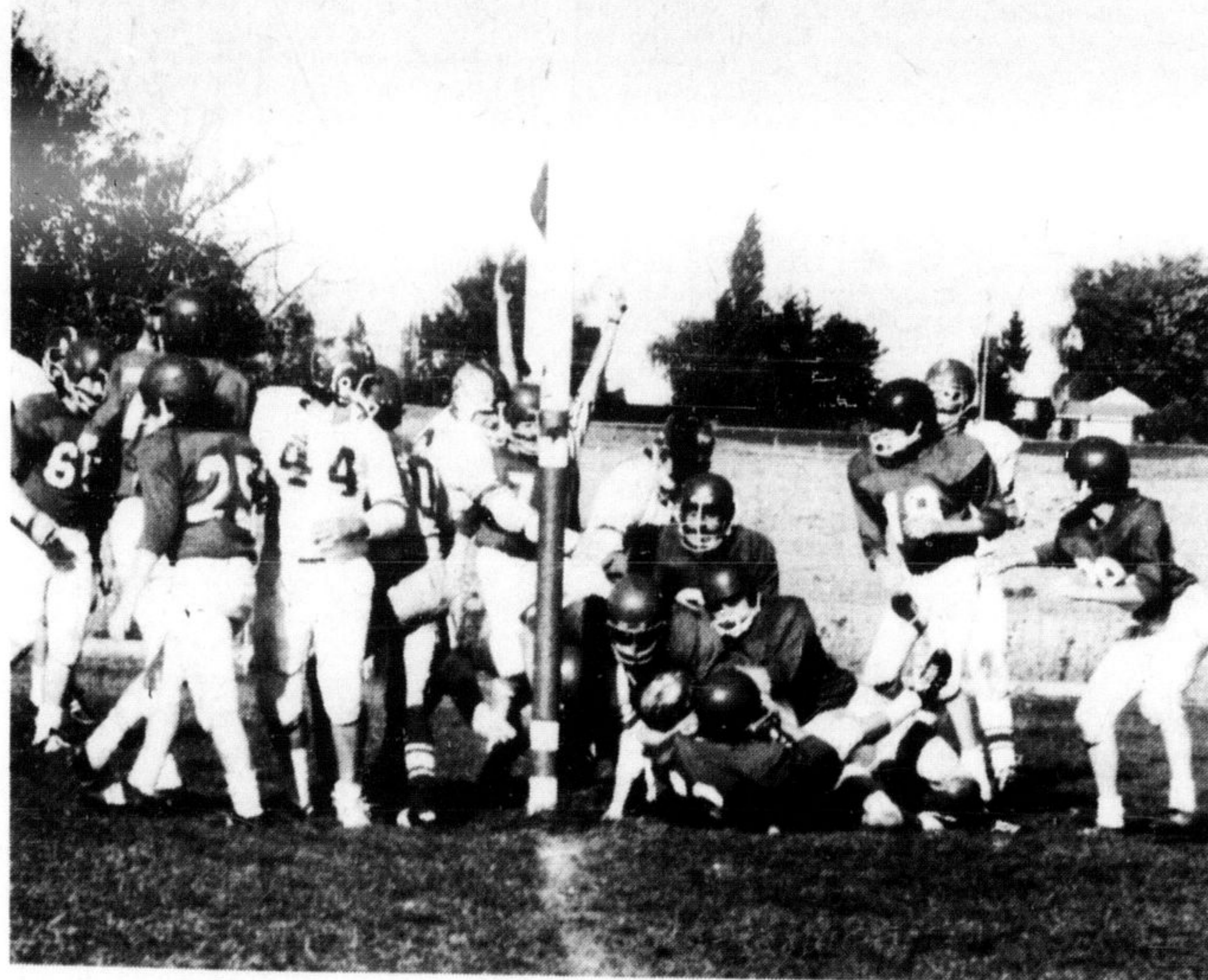
A TOUCHDOWN is signalled by the referee after the Milton Junior Mustangs pushed their way from the two or three yard line into Georgetown's end zone during a game Friday. The juniors experienced some problems in taking the lead away from Georgetown. They lost 9-7 on home ground.

The team plays Wednesday (today) against Oakville Trafalgar.