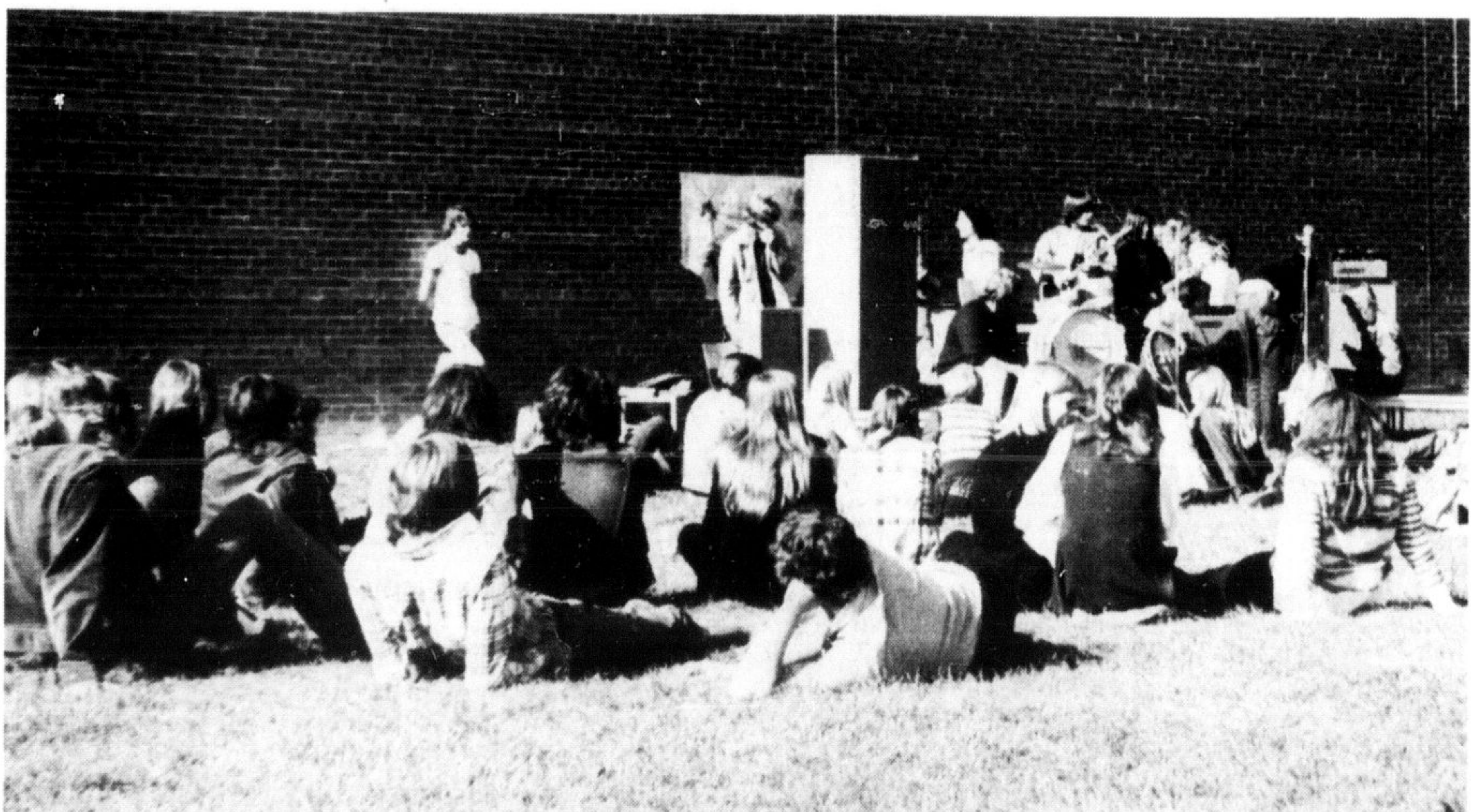
A NEW IDEA at the Milton District High School Forum came to light Friday when local students performed before audiences of up to 100 people in a