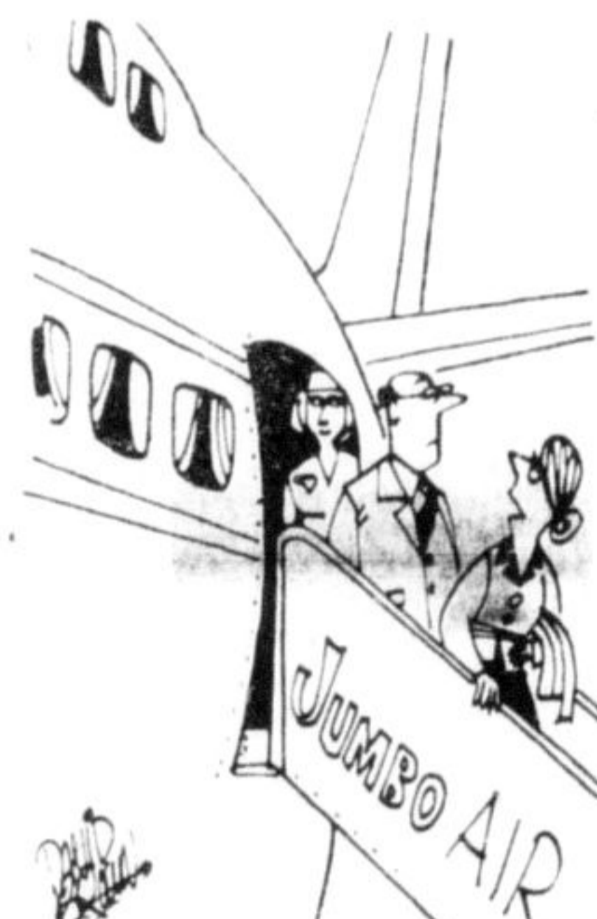
"How would you like to fly 2000 miles alone while I spent three hours in the piano bar?"

Drivers are advised never to overtake another car on a back road without first signalling by horn or headlights. If the driver ahead doesn't know you are there, the Ontario Safety League points out, it is possible he will collide with you by swerving suddenly to the left to avoid a bump or chuckhole.