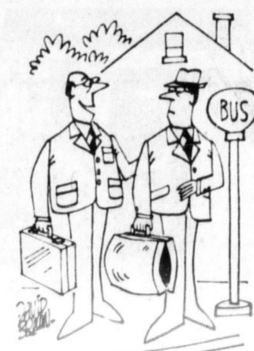
"I see you're off your diet, Marvin."

Commute All instructors have commitments other than the Milton club and commute from their resident cities.