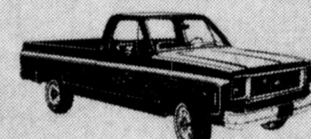
C/10 Cheyenne Super Fleetside Pickup