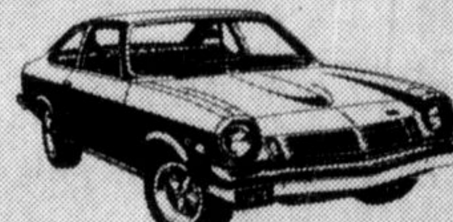
Vega GT Hatchback Coupe