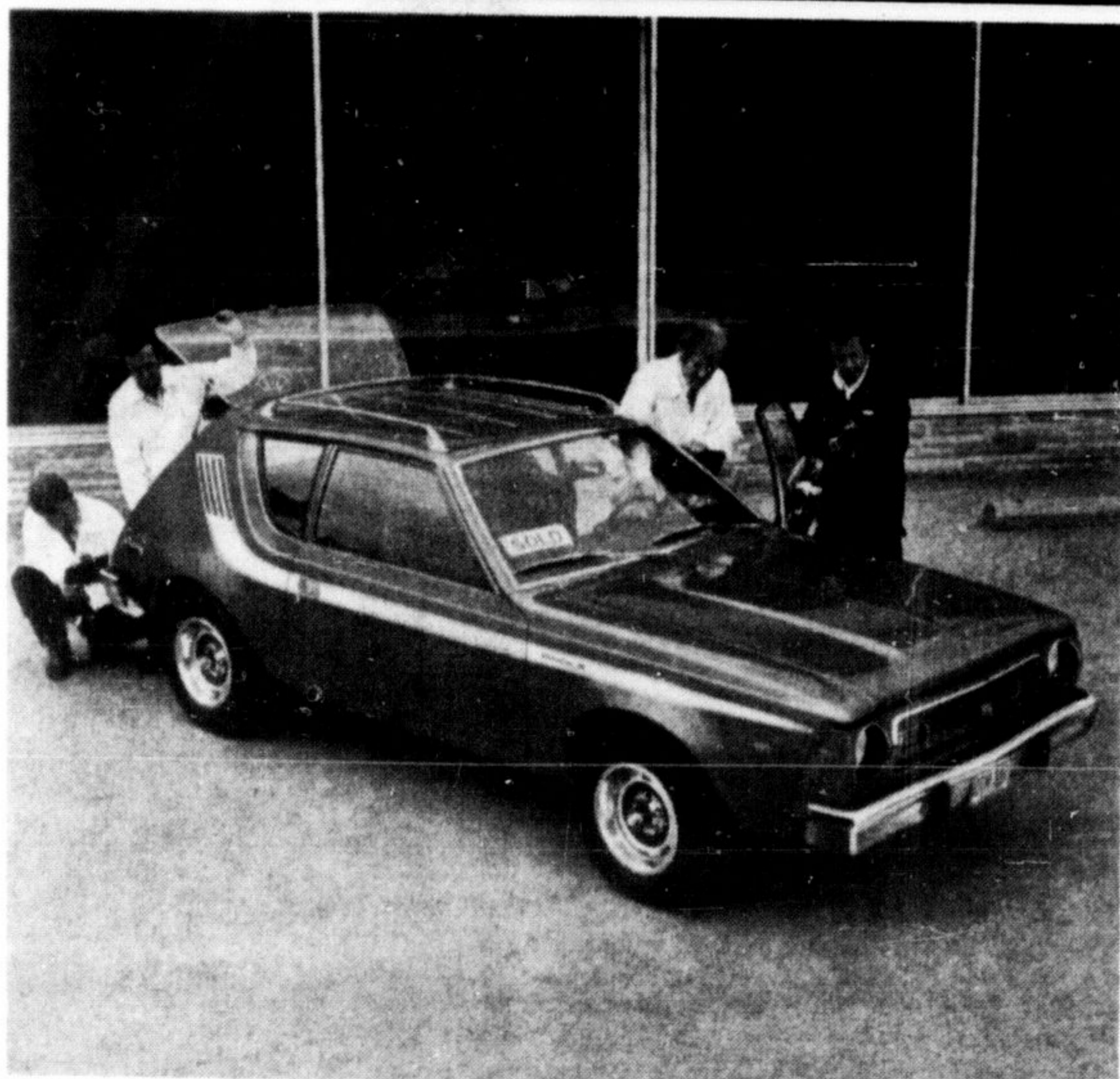
Car shown is the 1974 Gremlin X $2716

The American Motors Buyer Protection Plan. Every '74 AMC car we build has to pass with top marks before it gets to the toughest car inspector we know.