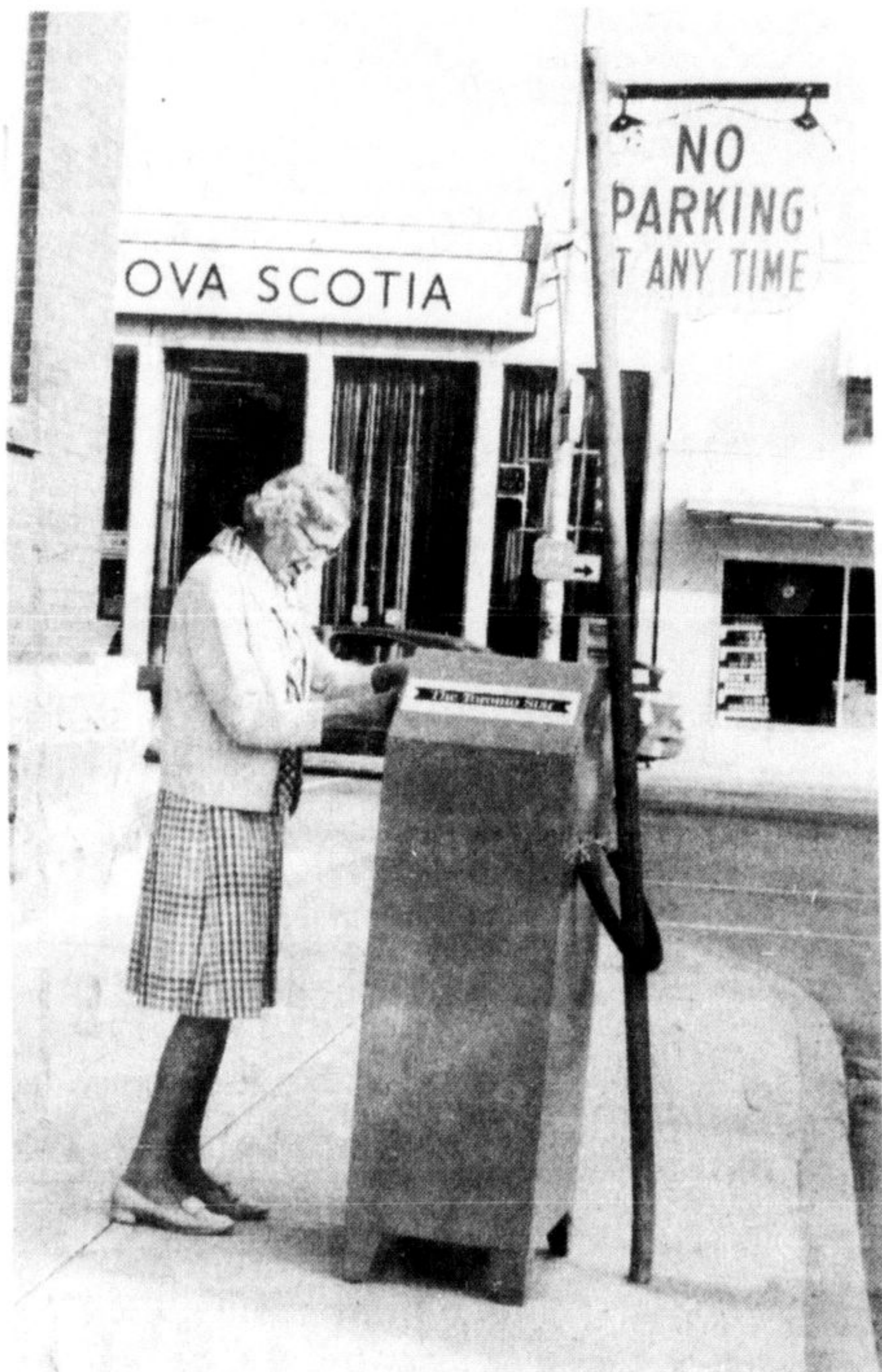
SOMETHING DIFFERENT has been tried by a Toronto daily paper in an attempt to thwart theft of its paper vending boxes. This one is chained to a town "no parking" sign on Martin St. beside the post office. It should work, if nobody steals the sign too. The lady in the picture was an honest-to-goodness cash customer, incidentally, not an aspiring criminal.