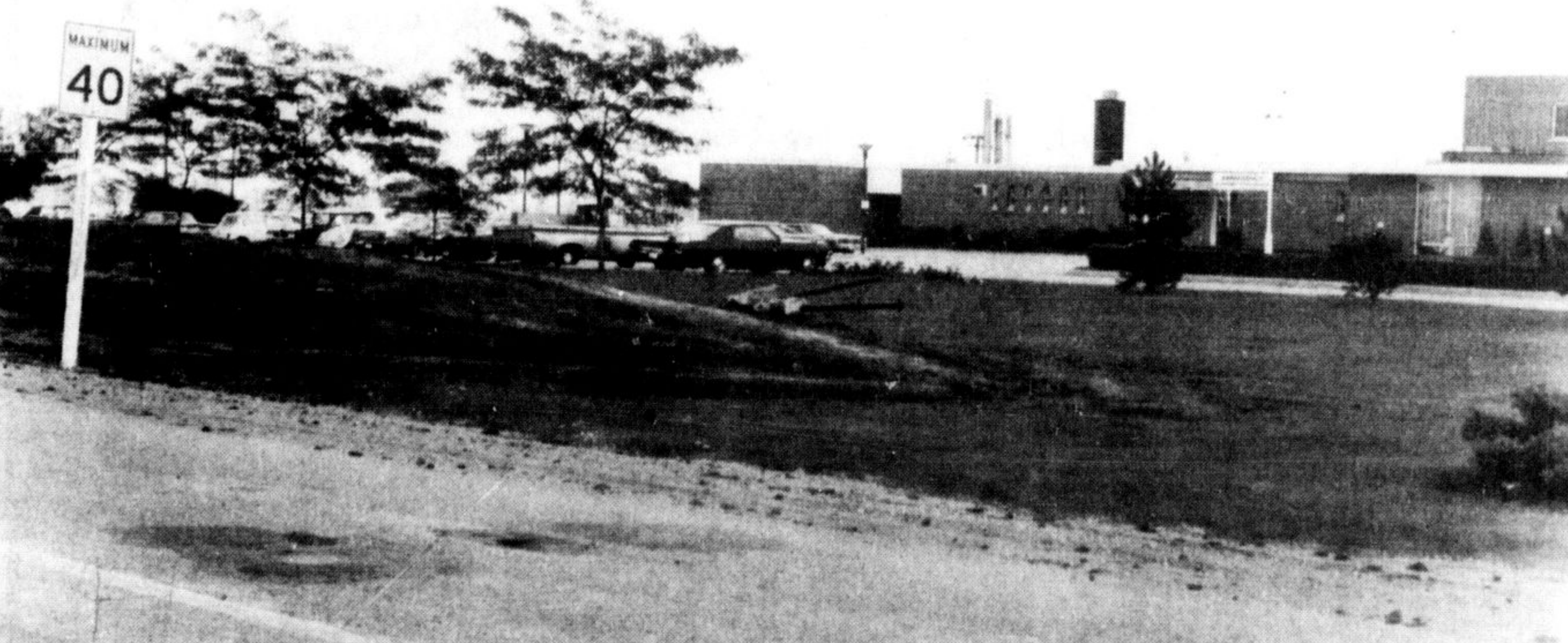
EARTH BERMS AND TREES are going in this week along the front and west side of Milton District Hospital, in an effort to cut down the noise of highway traffic which is bothering patients. Five shaped berms (mounds of earth) about four

to five feet in height have been built and they will be planted with large and small trees to help deflect the noise. One of the berms is shown in the foreground of this picture.