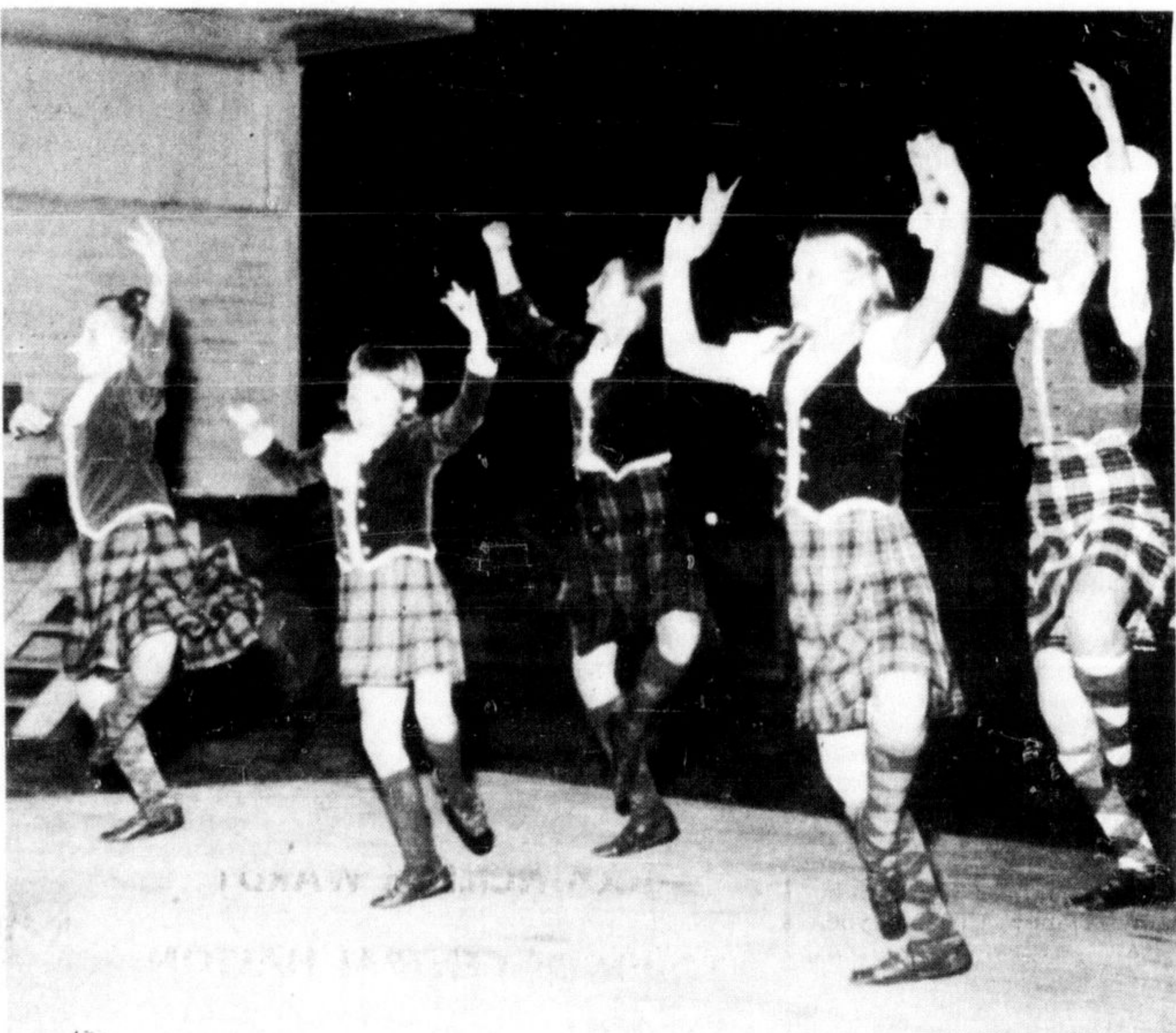
THE MILTON CHAPTER of the Western Ontario Highland Dancing Association performed in front of the grandstand at Milton Fair Friday night.