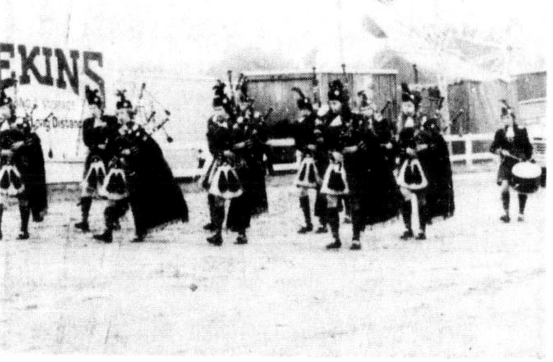
GEORGETOWN GIRLS' PIPE BAND added color to the official opening ceremony at Milton Fair Saturday.