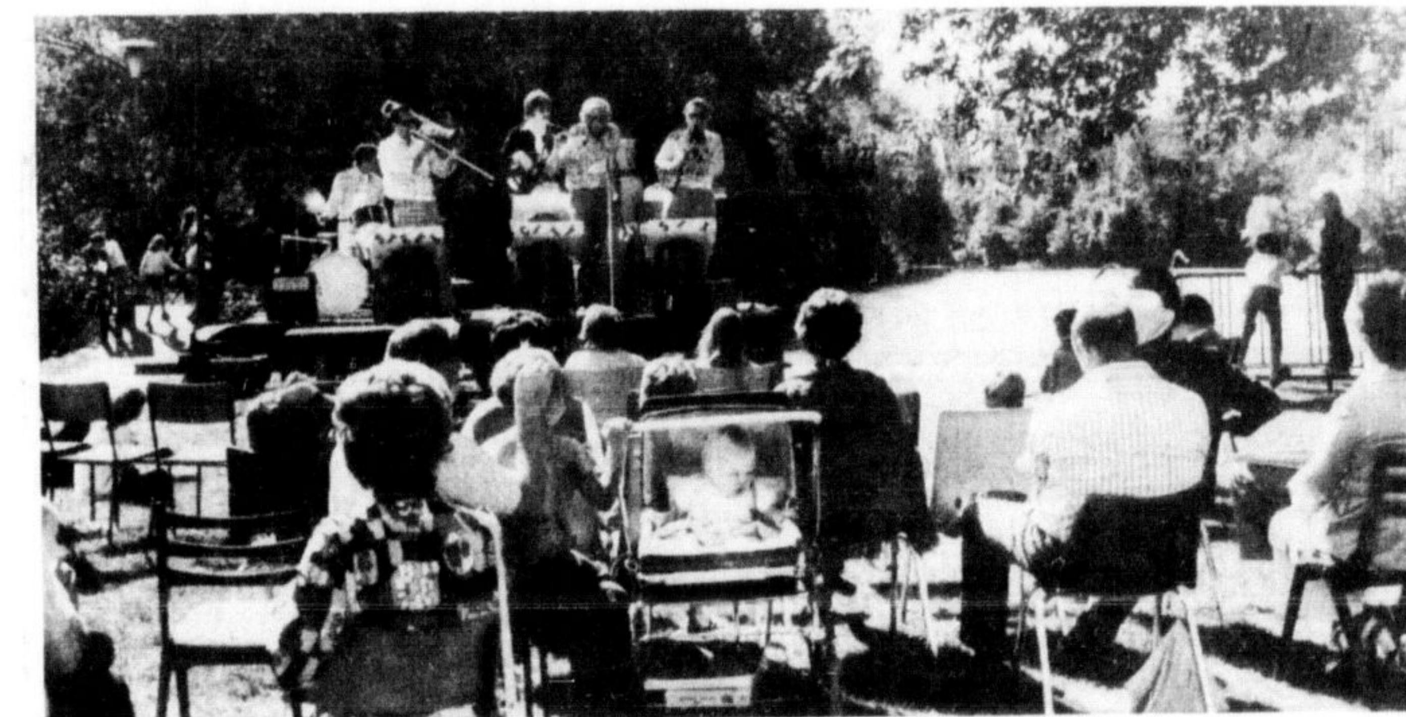
STEEL CITY SIX presented The Many Faces of Jazz in a concert on the banks of the Mill Pond Saturday under the sponsorship of the Milton Library. The program was just across from the Milton District Hospital Auxiliary Lawn Party and provided additional entertainment for visitors to that event.