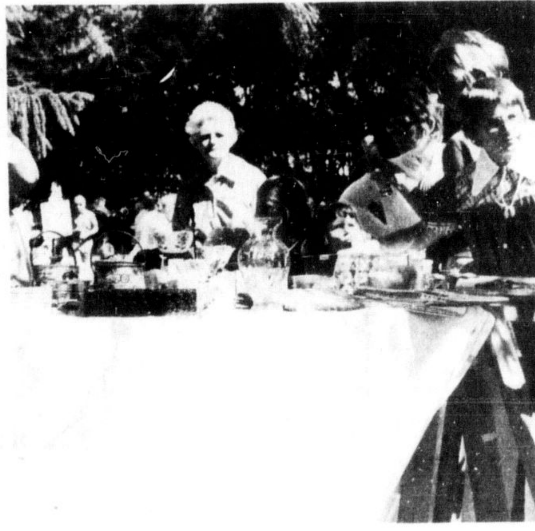
THE HOSPITAL AUXILIARY'S annual lawn party Saturday was a successful event as hordes of buyers attended to shop at various booths, enjoy afternoon tea and see the art show and jazz concert across the road at the mill pond. Above, an overall