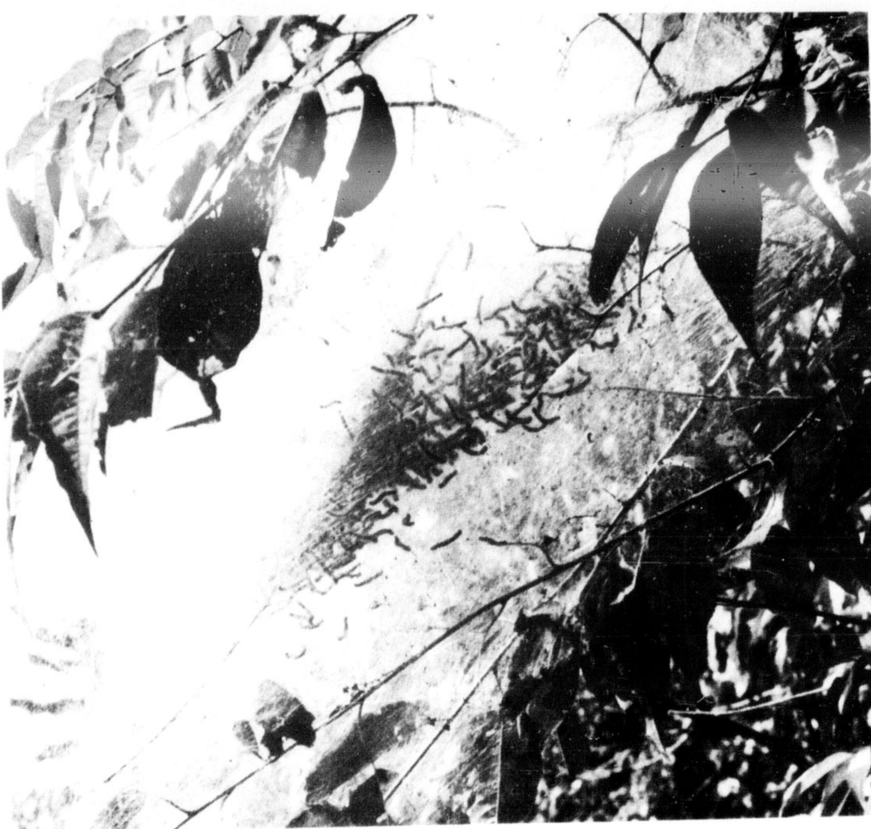
TENT CATERPILLARS have invaded trees throughout the Milton district and they are an ugly sight. This tree on Derry Rd. near Lowville was badly infested with caterpillars last week.