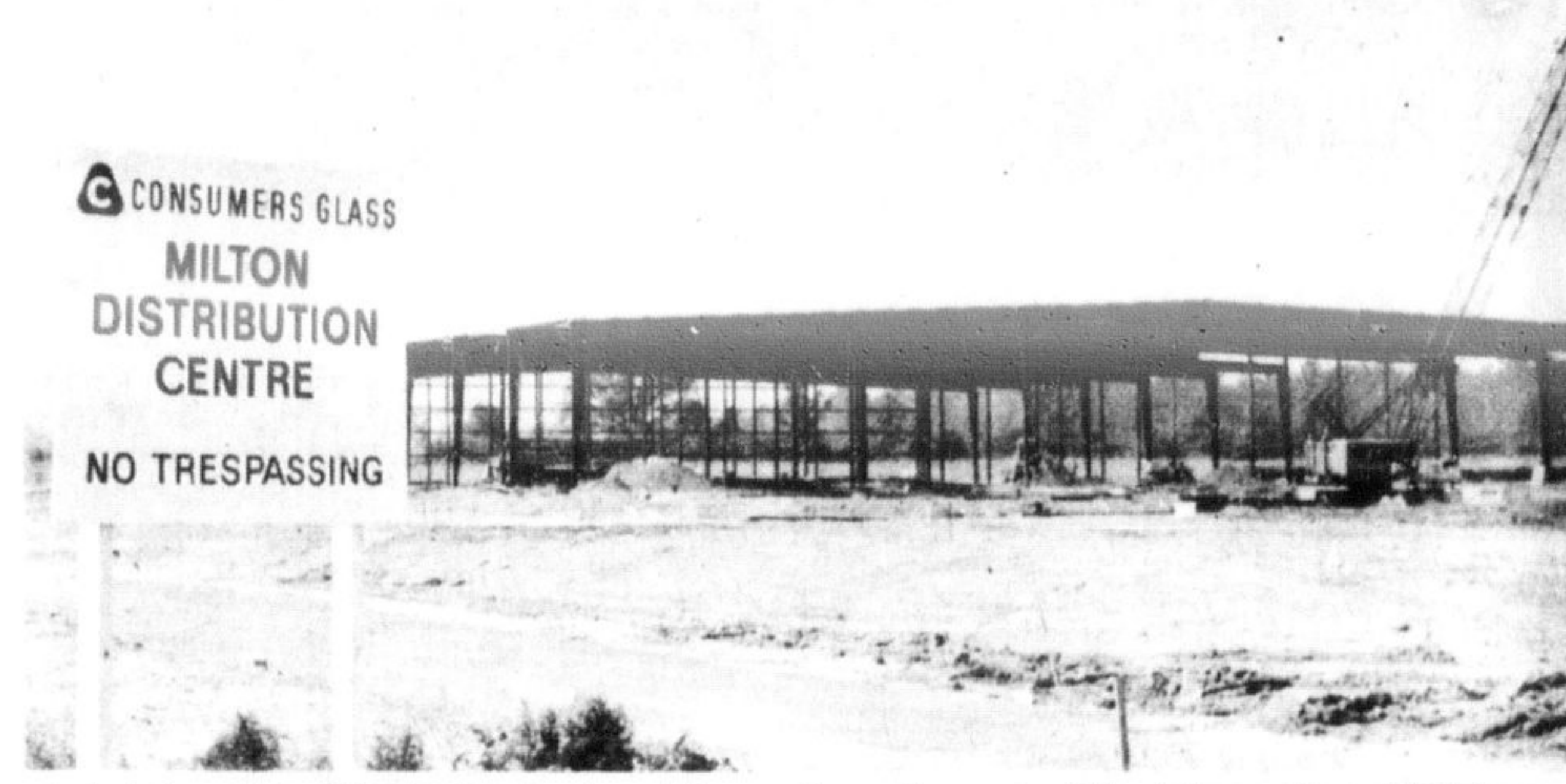
A skeleton of steel is starting to rise at the south-west corner of the intersection of Highways 401 and 25, where Consumers Glass is erecting a new distribution centre. The plant is 396 by 650 feet and will cover six acres of ground or 275,000 square feet of floor area. The office and distribution centre is valued at $1,140,000. Consumers has an 88 acre site off Chisholm Dr. Construction of this plant is another mark of industrial progress for Milton.

For a progressive Insurance Programme at competitive rates contact