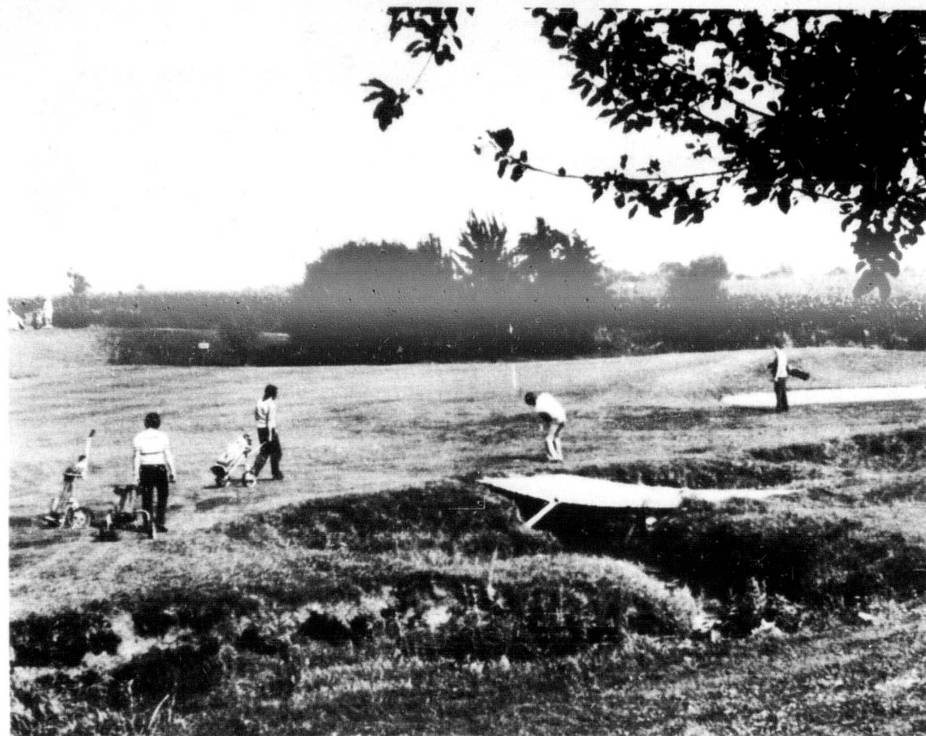
IF YOU'RE LUCKY, or good, you can chip up onto the 17th green at Hornby Tower Golf Club without any penalty strokes. The creek catches many drives along that fairway.