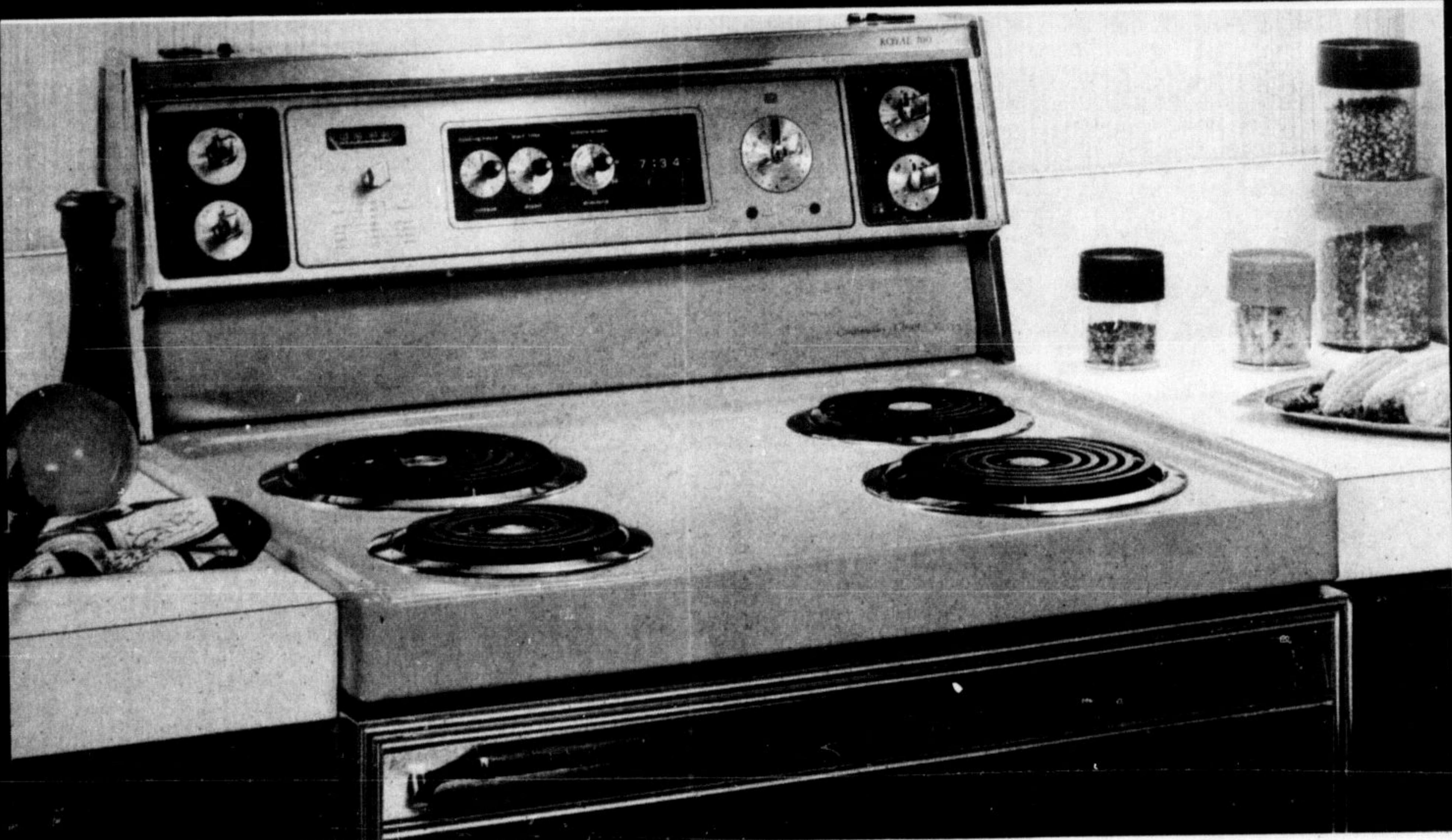
Royal - 100 - 24 exciting features - plus

The Inglis Range. Everything you'd expect and then some.