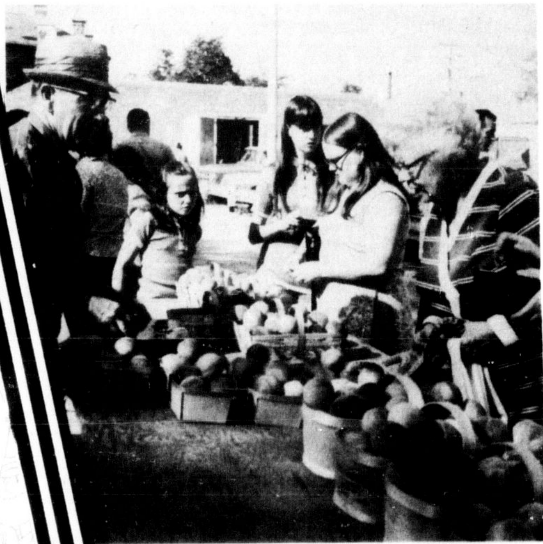
Meet your friends and neighbors at Milton's Farmers' Market every Saturday morning to Oct. 20

• Farm fresh produce by well-known vendors • Shop at leisure