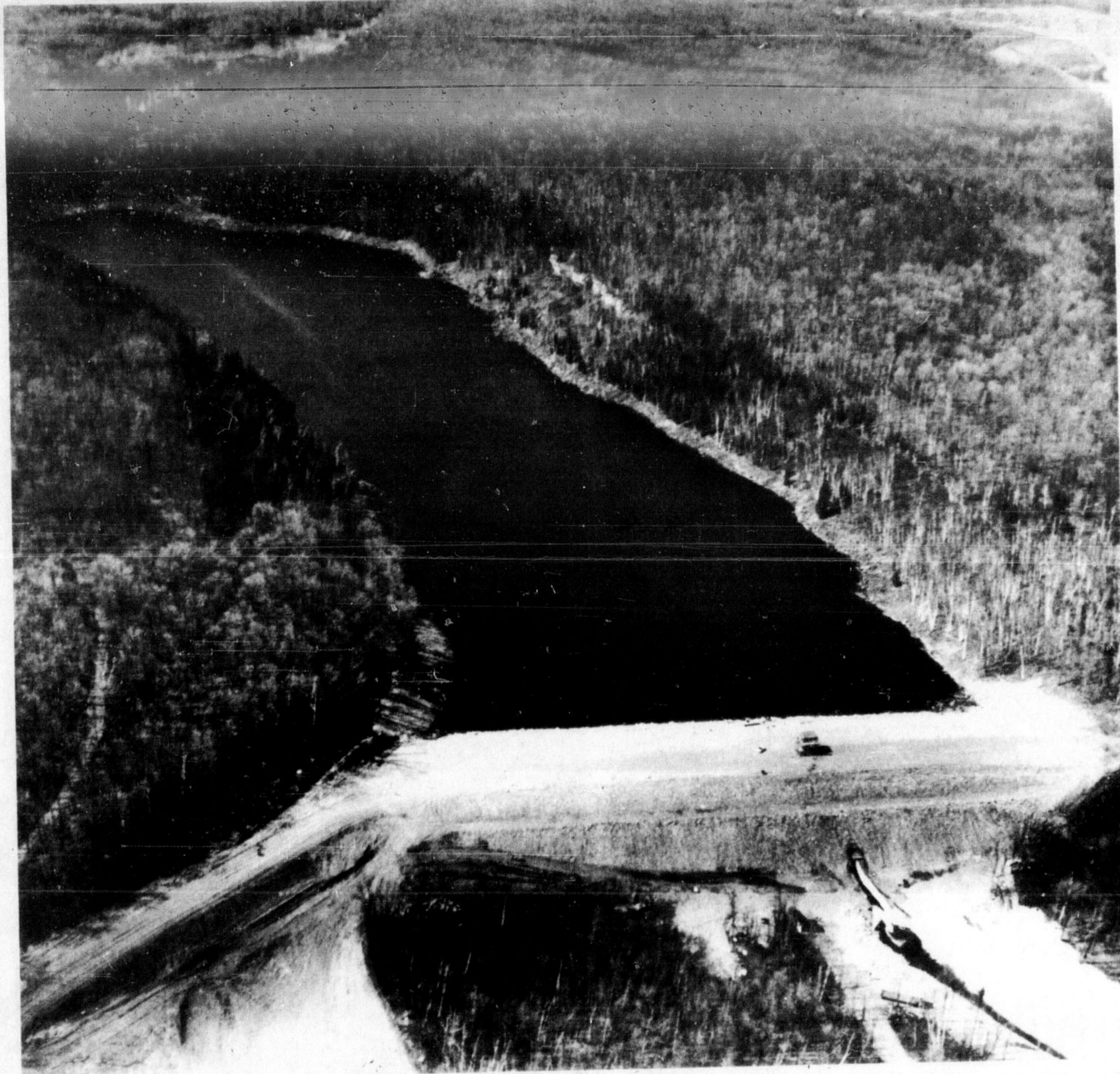
A PICTURESQUE SIGHT from the air, the reservoir at Hilton Falls Dam appears to be nearly full. The project includes 523 acres of land in Nassagaweya and the reservoir itself will cover 75 acres of land and have the ability to store 1,800 acre feet of water.