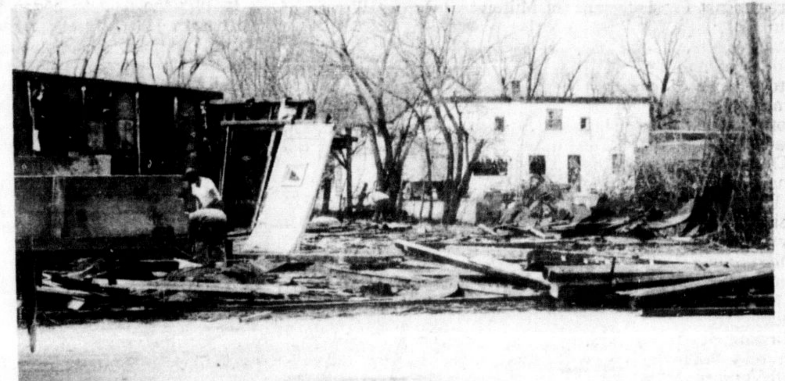
Progress takes many forms. In some cases older buildings are removed to make way for new ones and recently Milton Lumber buildings which have occupied a site on Mill St. for many years were being removed. Plans call for construction of a new hotel on the site with 89 suites in a six storey building.