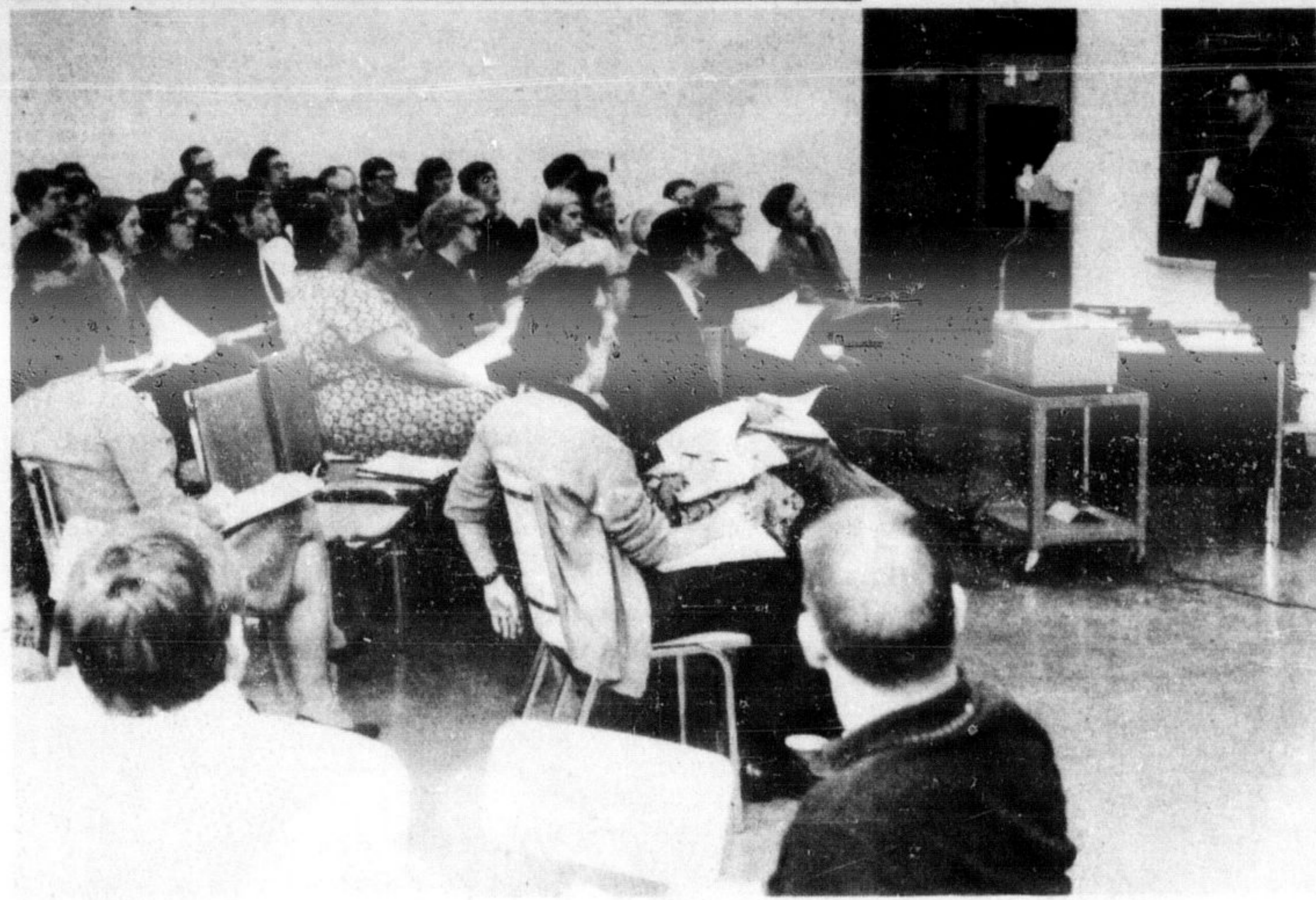
A WORKSHOP FOR TEACHERS was held Wednesday to Friday at Milton District High School, while the students were busy writing examinations. Parent volunteers supervised the exams, to free the teachers for a special workshop on curriculum design that will assist them in the transition to the semester system being introduced next year. While