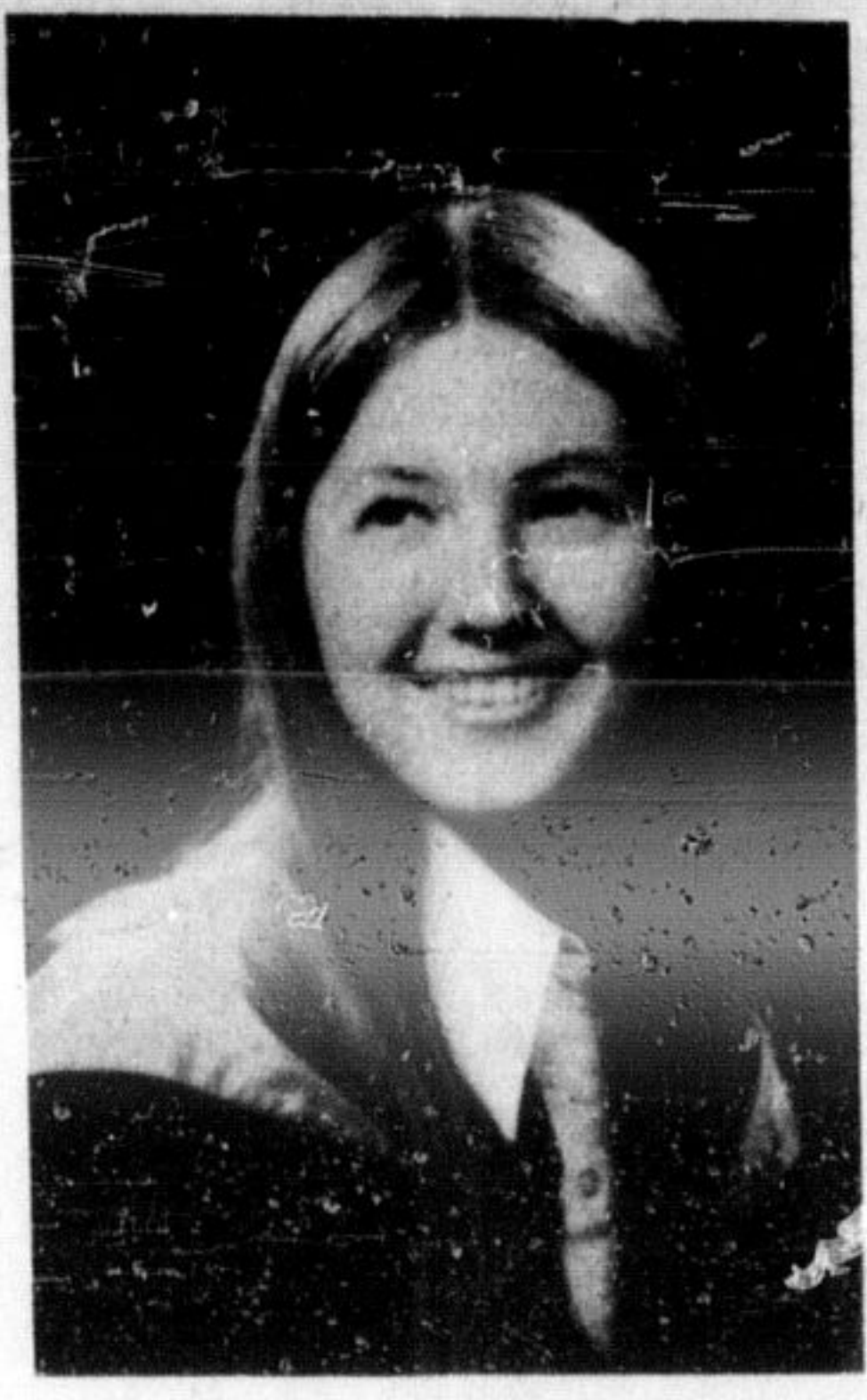
B. Sc. in CHEMISTRY