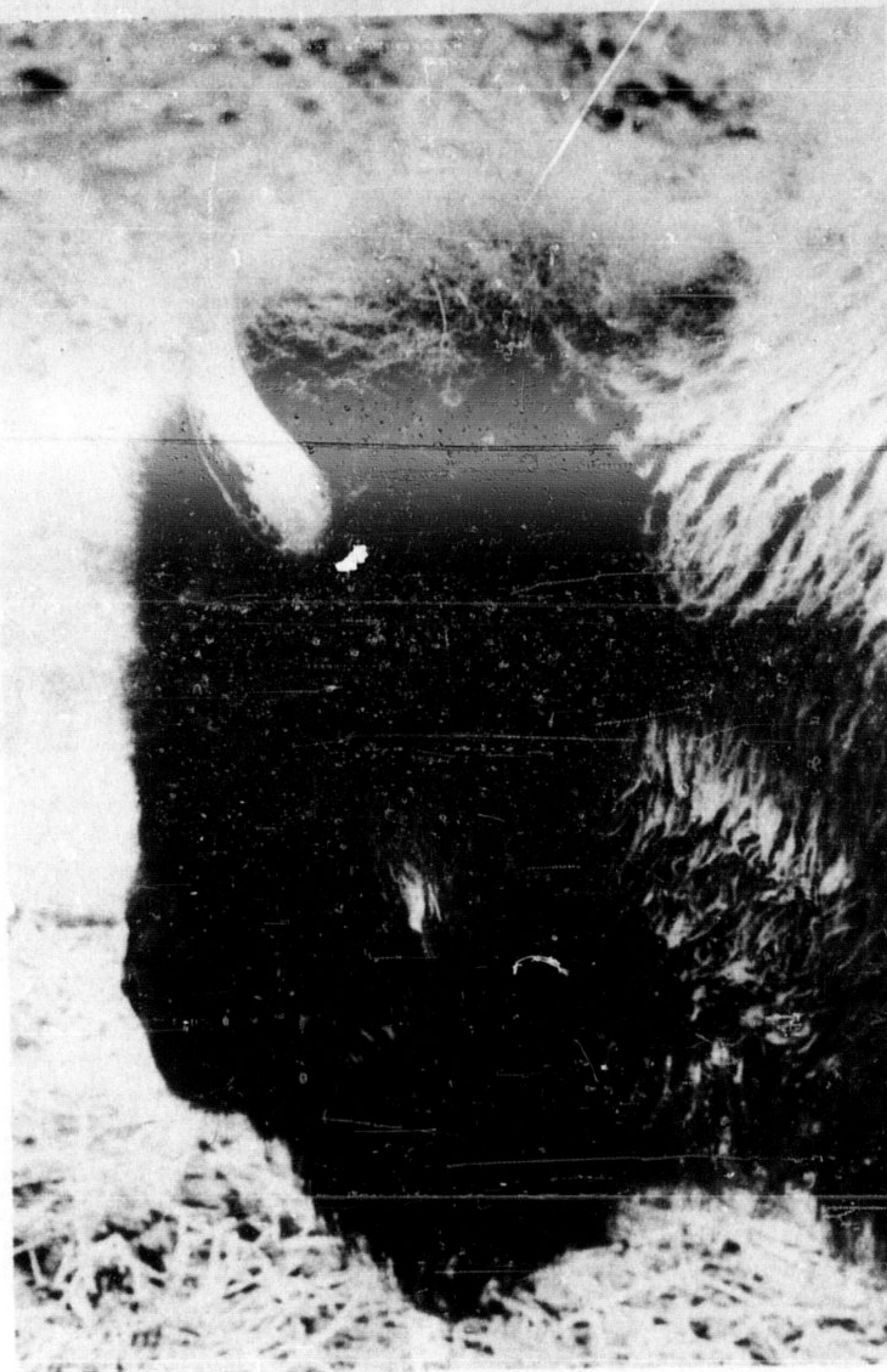
A YOUNG BUFFALO bull from the Halton Region Conservation Authority herd at Rattlesnake Point Park has been sold to the city of Sault Ste. Marie, to replace an animal which was shot at Christmas time. HRCA has a surplus of buffalo right now—there are presently 21 animals.

Authorized as Second Class Mail Postal Registration Number—0913