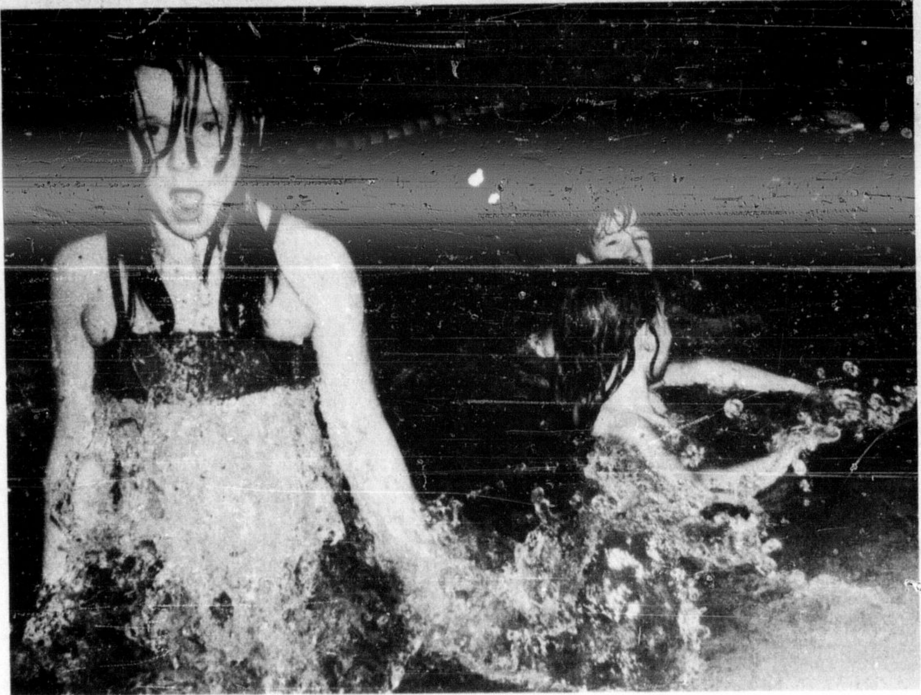
"SIMPLY SPLASHING" were the words to the public on Wednesday, Thursday and these girls might use to describe swimming at Friday. the OSD pool last week. The pool was opened