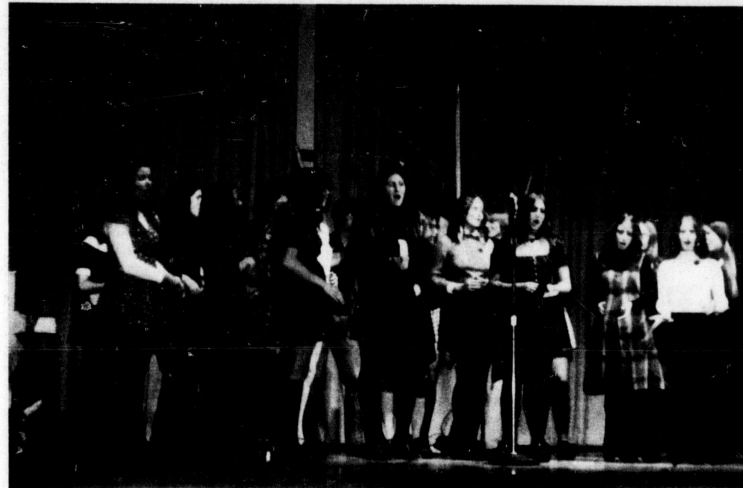
FOLK CLUB MEMBERS sing during the Friday. Remembrance Day assembly at MDHS on