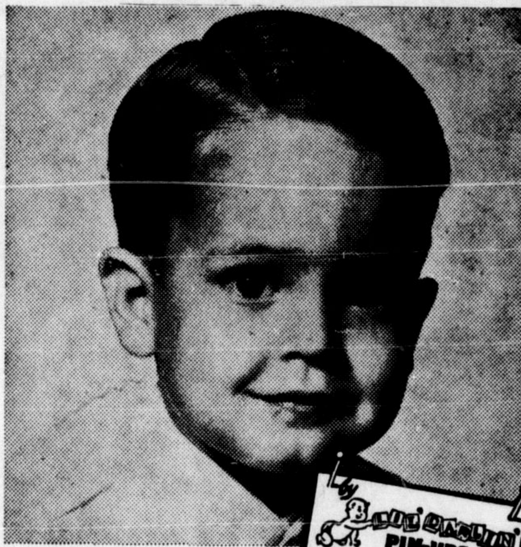
Photo offer good Oct. 31st to Nov. 4th