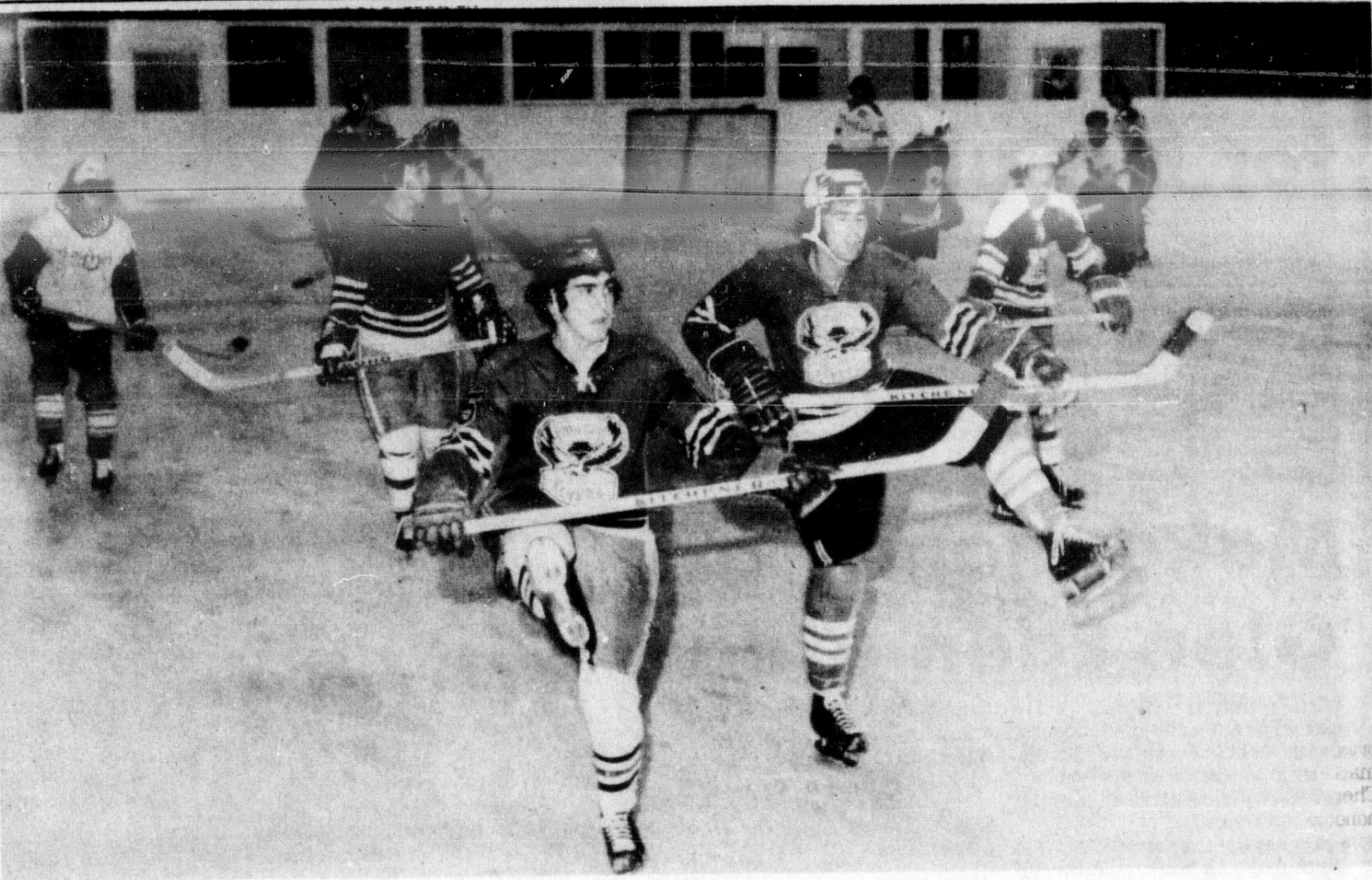
JUNIOR HOCKEY PLAYERS went through a thorough workout Monday night at the first full practice of the season. The club practiced Sunday morning but mostly local boys attended the one hour workout prior to the regular schedule of practices.