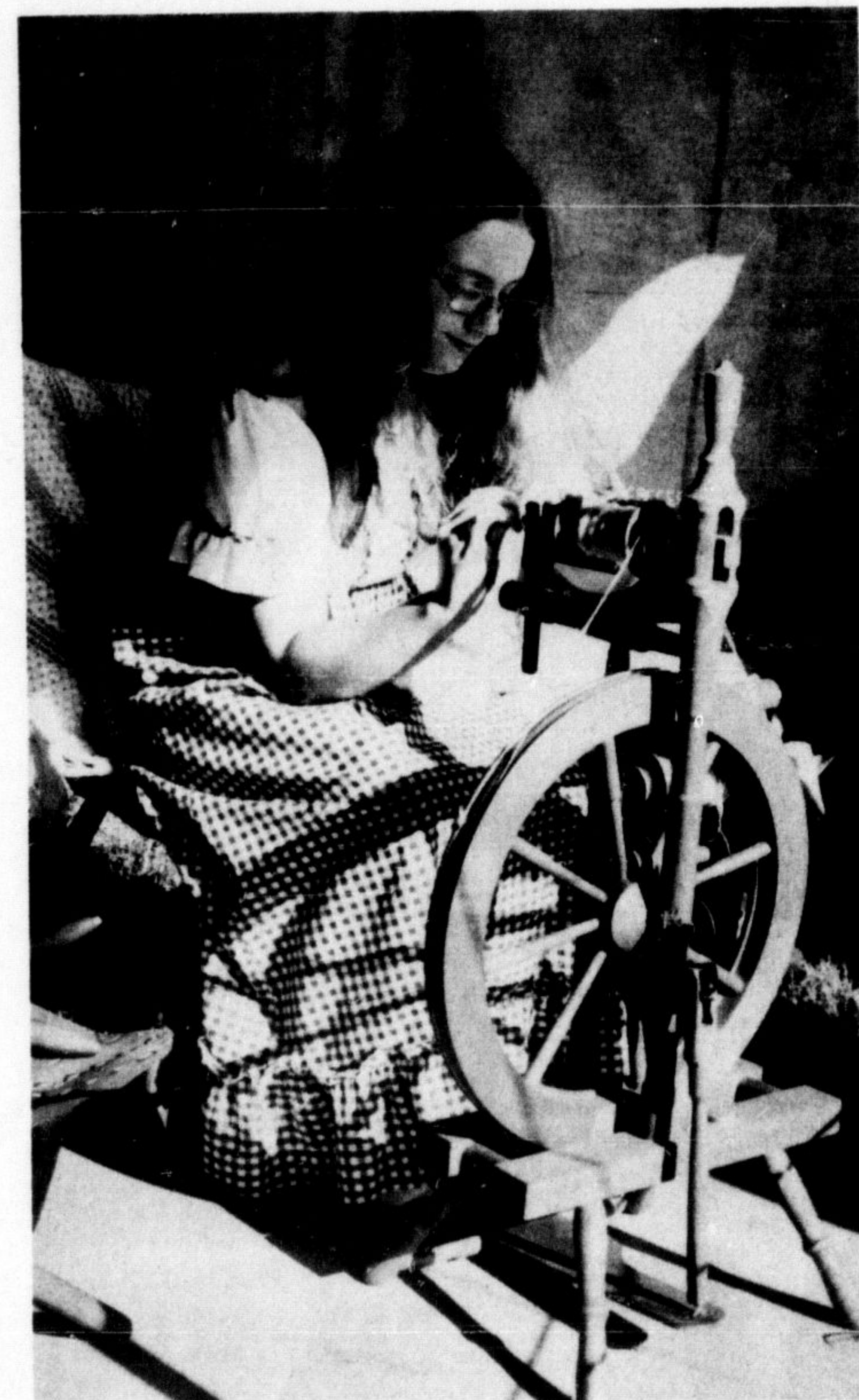
SPINNING AND WEAVING demonstrations at the weekend Steam-Era were mainly for the interest of the ladies, but visitors of both sexes enjoyed watching the artisans at work.