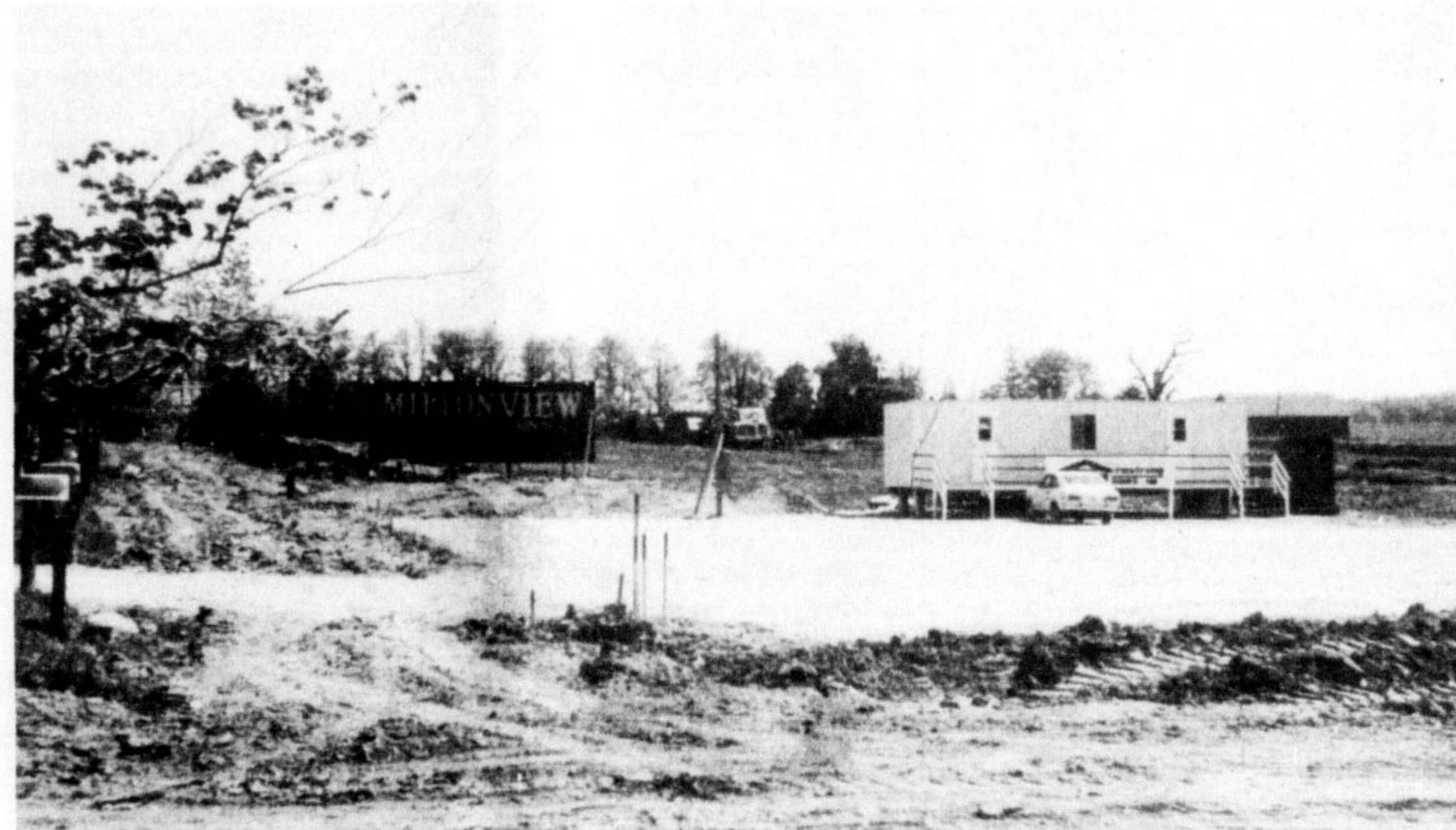
—Milton and district were blessed with another fine weekend for outdoor activities.