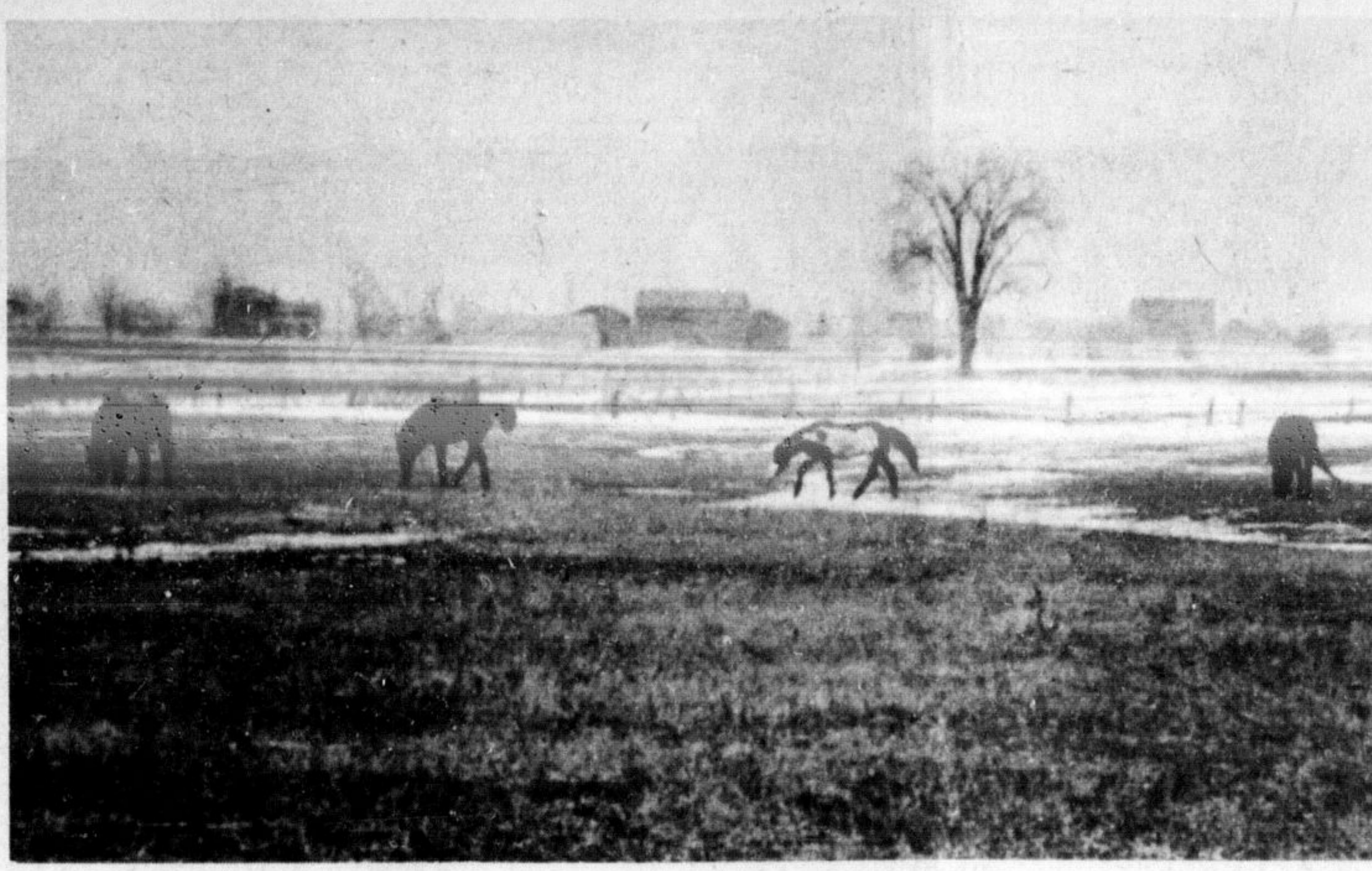
FROLICKING IN A FIELD in the district, these horses don't care if there is still a touch of snow on the ground—they're happy to get out into the fields in April after a winter of being cooped up inside. People are, too.

Some folks couldn't even borrow trouble if they had to put up the collateral.