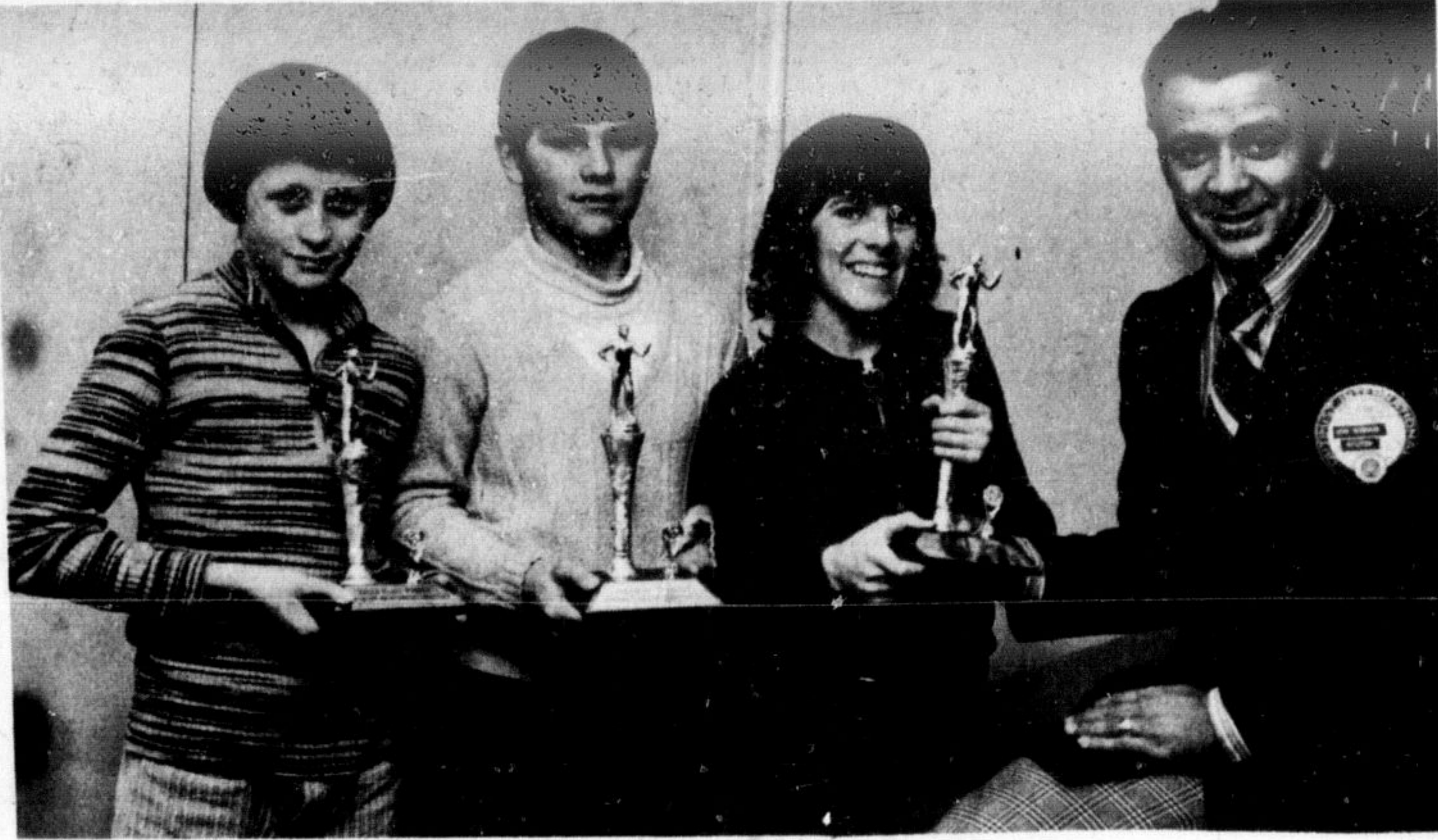
THREE WINNERS WERE CHOSEN LAST WEEK WHEN THE OPTIMIST CLUB OF MILTON HELD ITS ANNUAL BOYS' ORATORICAL CONTEST. THREE JUDGES FROM THE PORT CREDIT TOASTMASTERS CLUB CHOSE WINNERS FROM AMONG SEVEN ENTRANTS AND THEY WERE AWARDED TROPHIES.

girls' public speaking contest for the first time this year. It will be held on April 5.