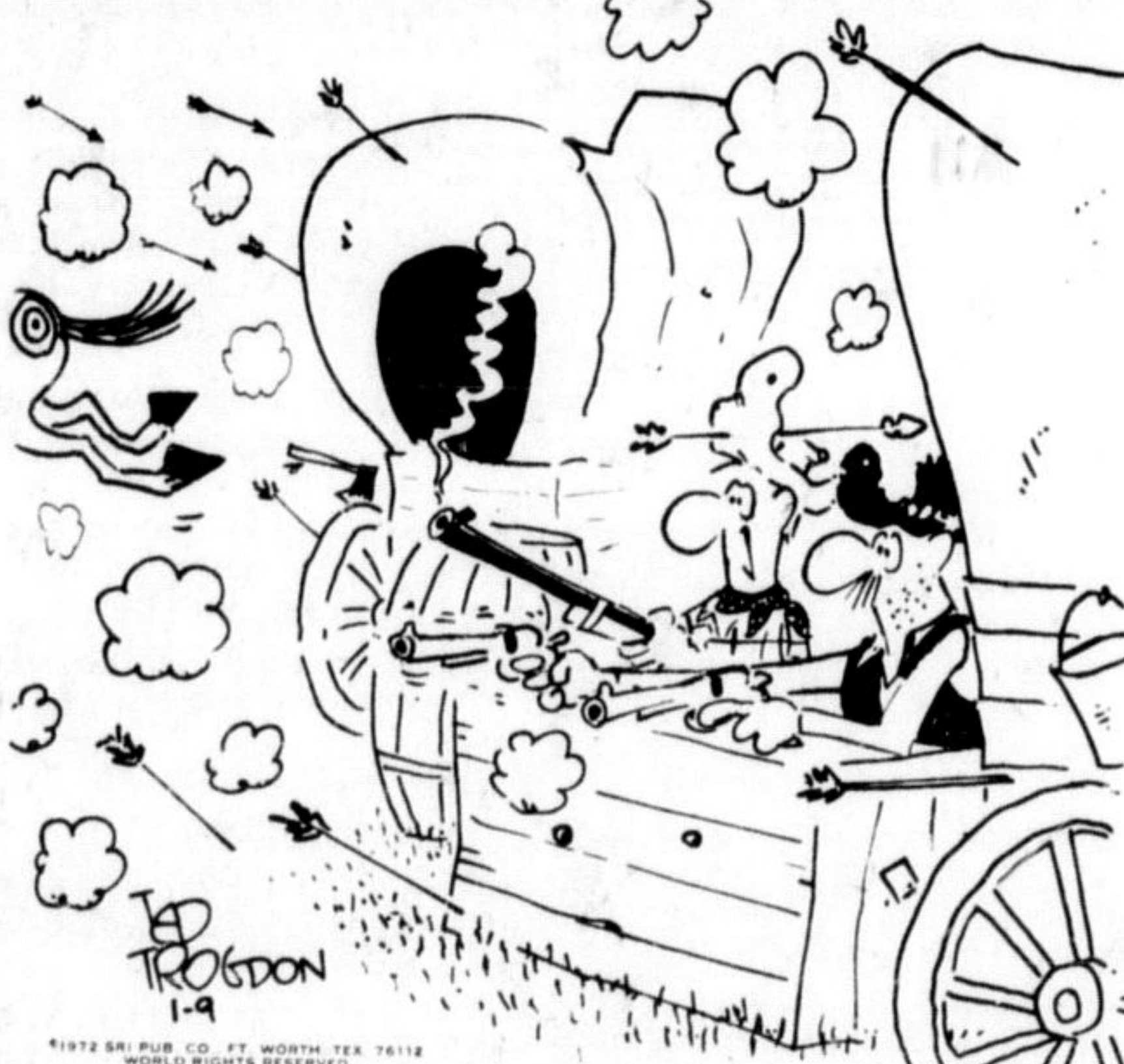
"Say . . . ain't them our kids out there helping the Injuns?"