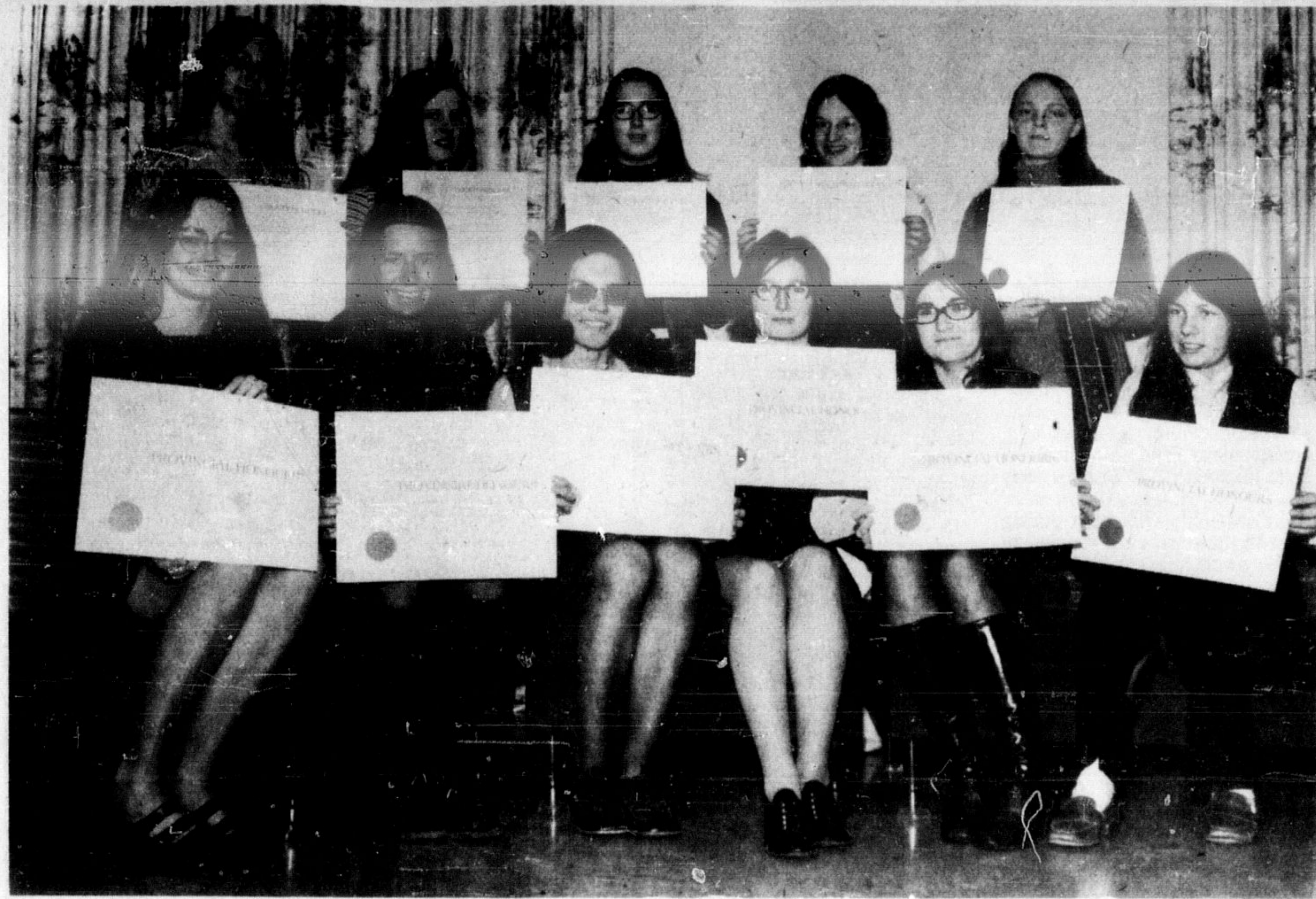
FOCUS ON FITNESS was the theme of the 4-H Homemaking Club Achievement Day held in St. Paul's United Church on Saturday. Provincial and County honors were presented to several girls of the 4-H Club, who over the years have managed to complete worthwhile projects under the direction of the 4-H Club. The holders of the Provincial Honors