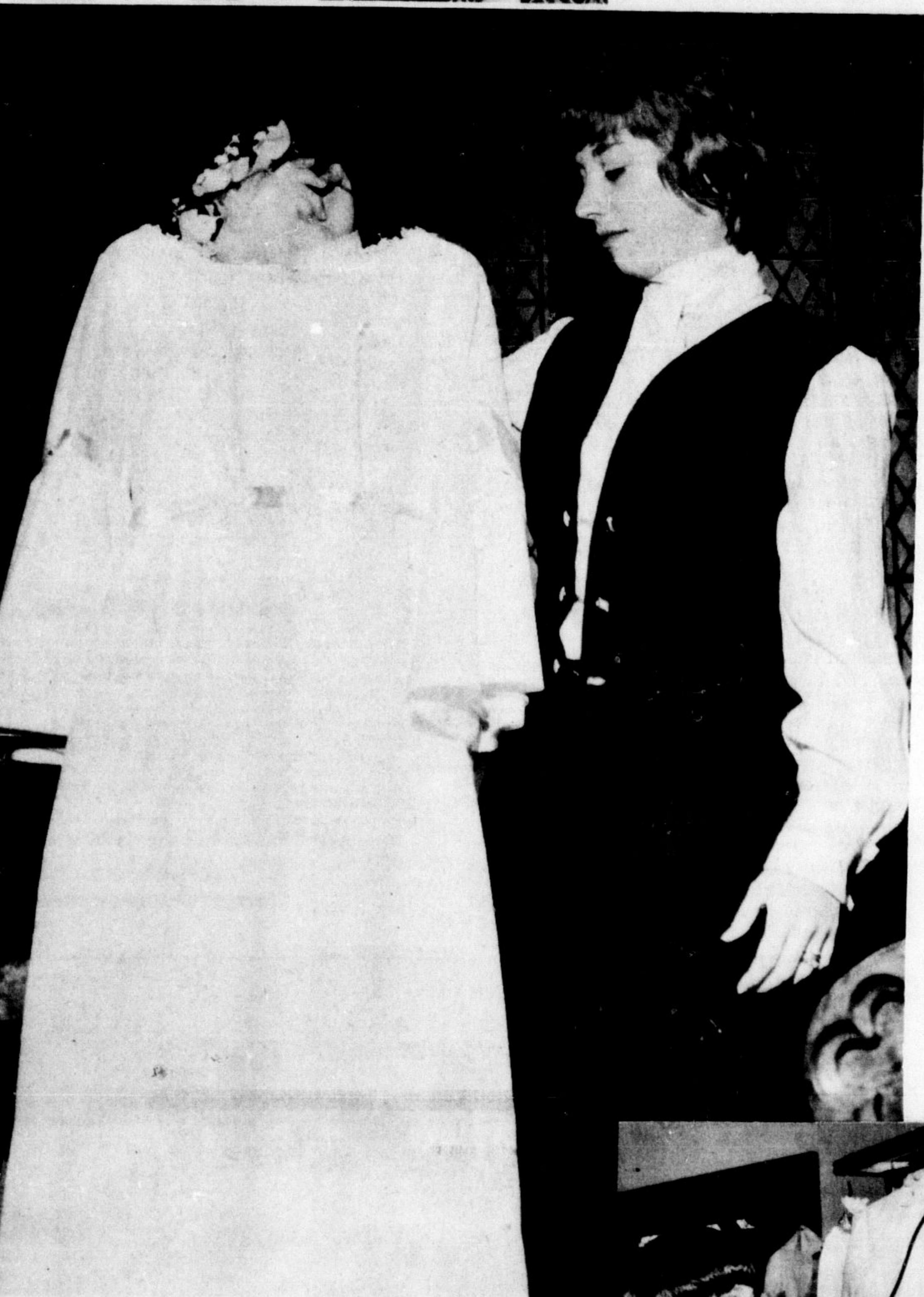
WEDDING GOWNS old and new were a highlight of the Bethel United Church Fall Bazaar at Drumquin on Saturday.

Aromas of homemade mince-meat and fresh baked pies touched the noses and taste buds of those in the crowd. The bazaar was almost SOLD OUT after the first half hour of operation.