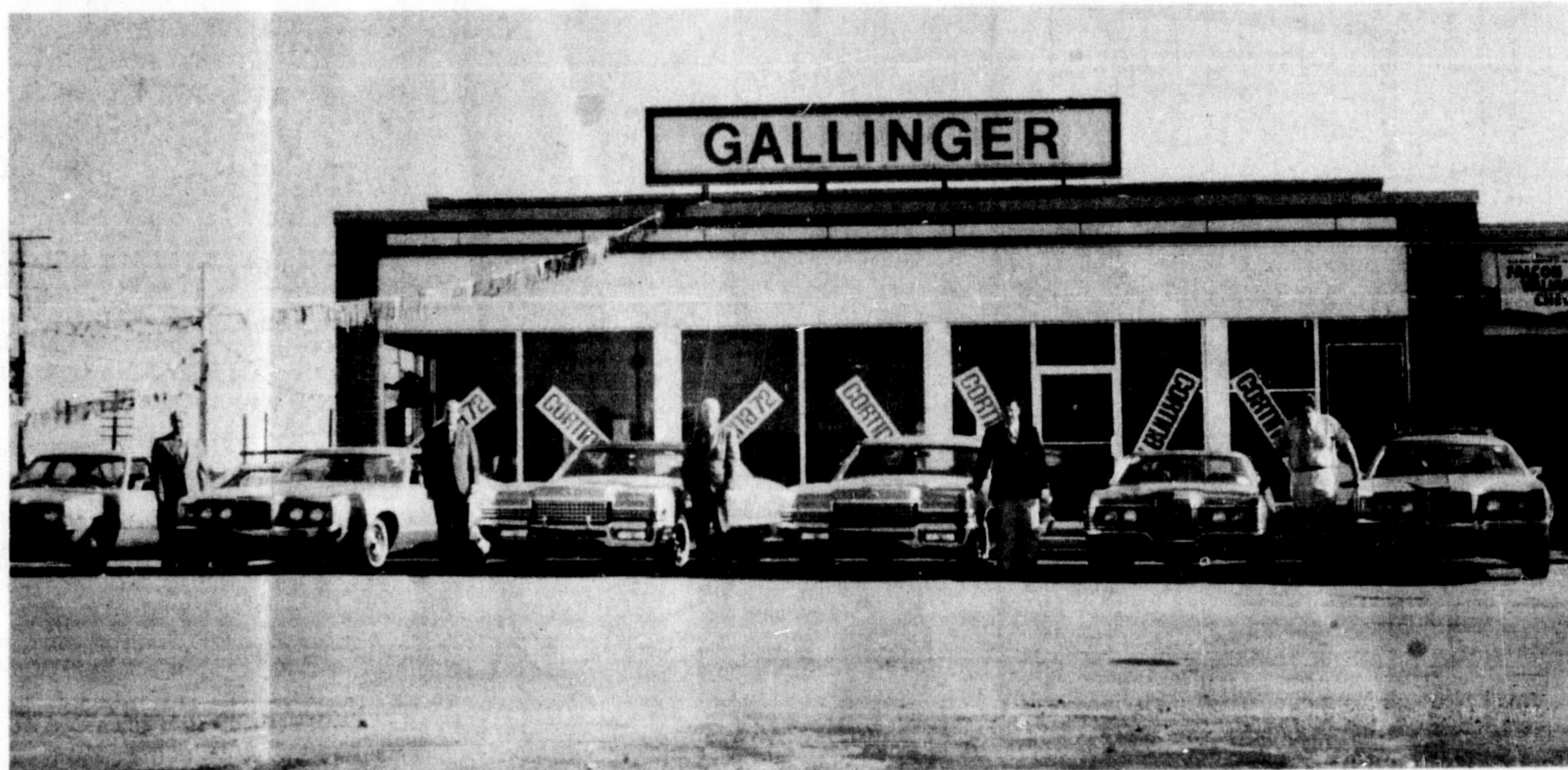
1972's are lined up and waiting. See them at Gallinger Motors this week

ON DISPLAY Thursday From 5 to 9 p.m. Friday 9 a.m. to 9 p.m. Saturday 9 a.m. to 9 p.m.