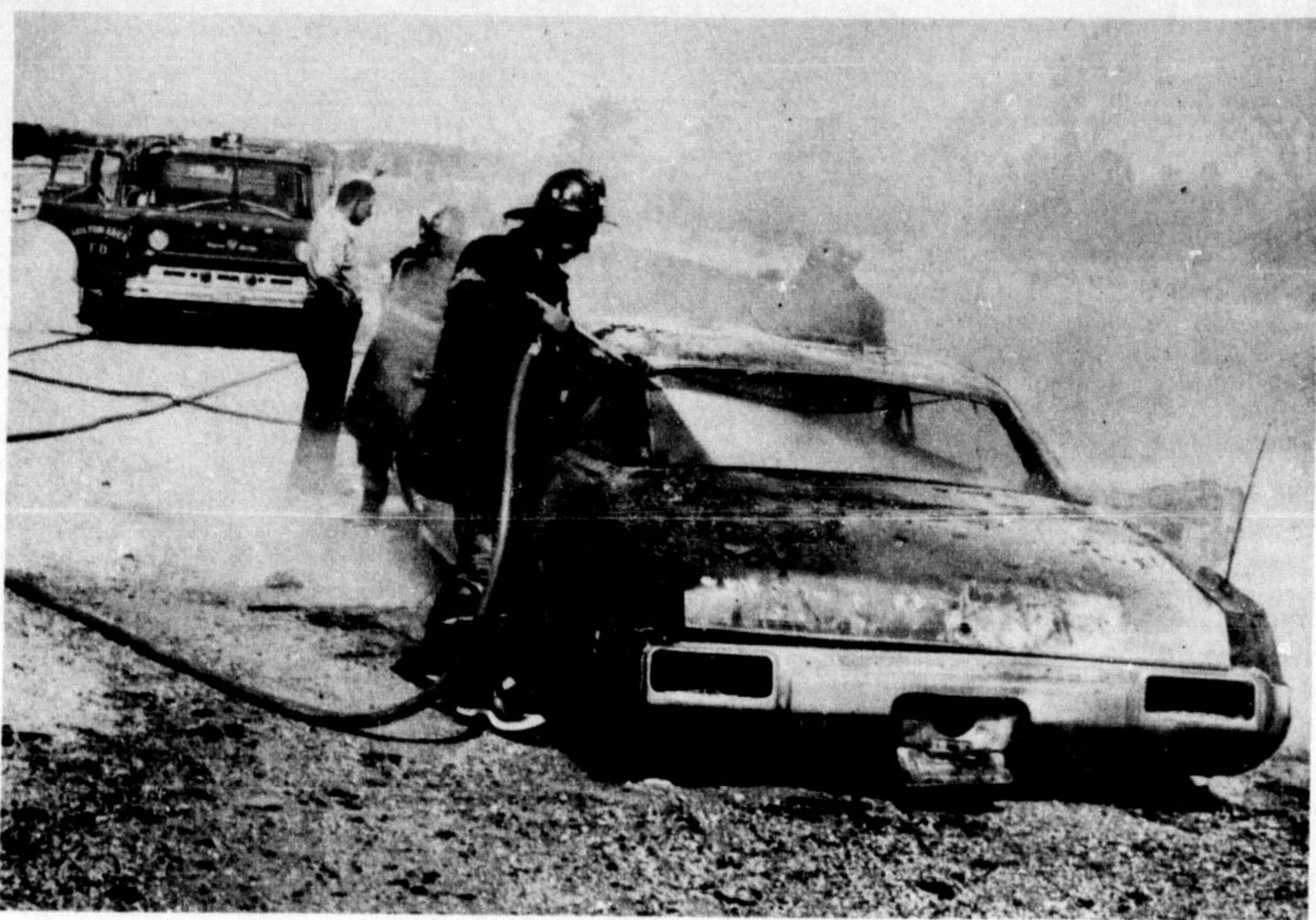
A LATE MODEL OLDSMOBILE was demolished when the car caught fire and flames gutted the interior of the car. The car was a complete write-off. The car owned by William Rotman of London caught fire on Highway 401 near Kelso. Firemen are shown fighting the blaze.