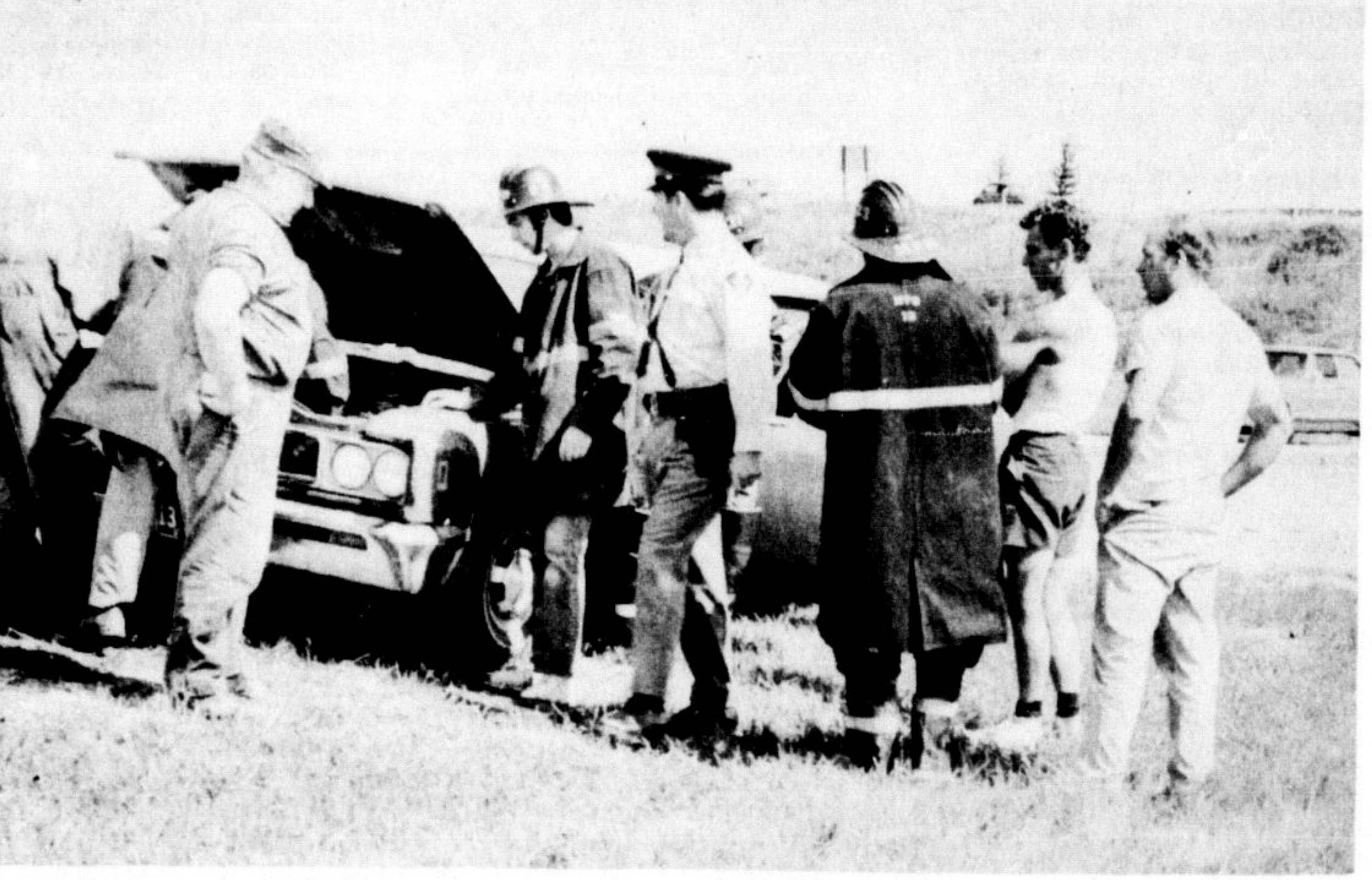
MILTON FIRE DEPARTMENT responded to a call on Highway 401 at Hornby Thursday. A car owned by W. H. Fleulling of Toronto caught fire. Considerable damage was done but firefighters were able to save the car from being gutted.