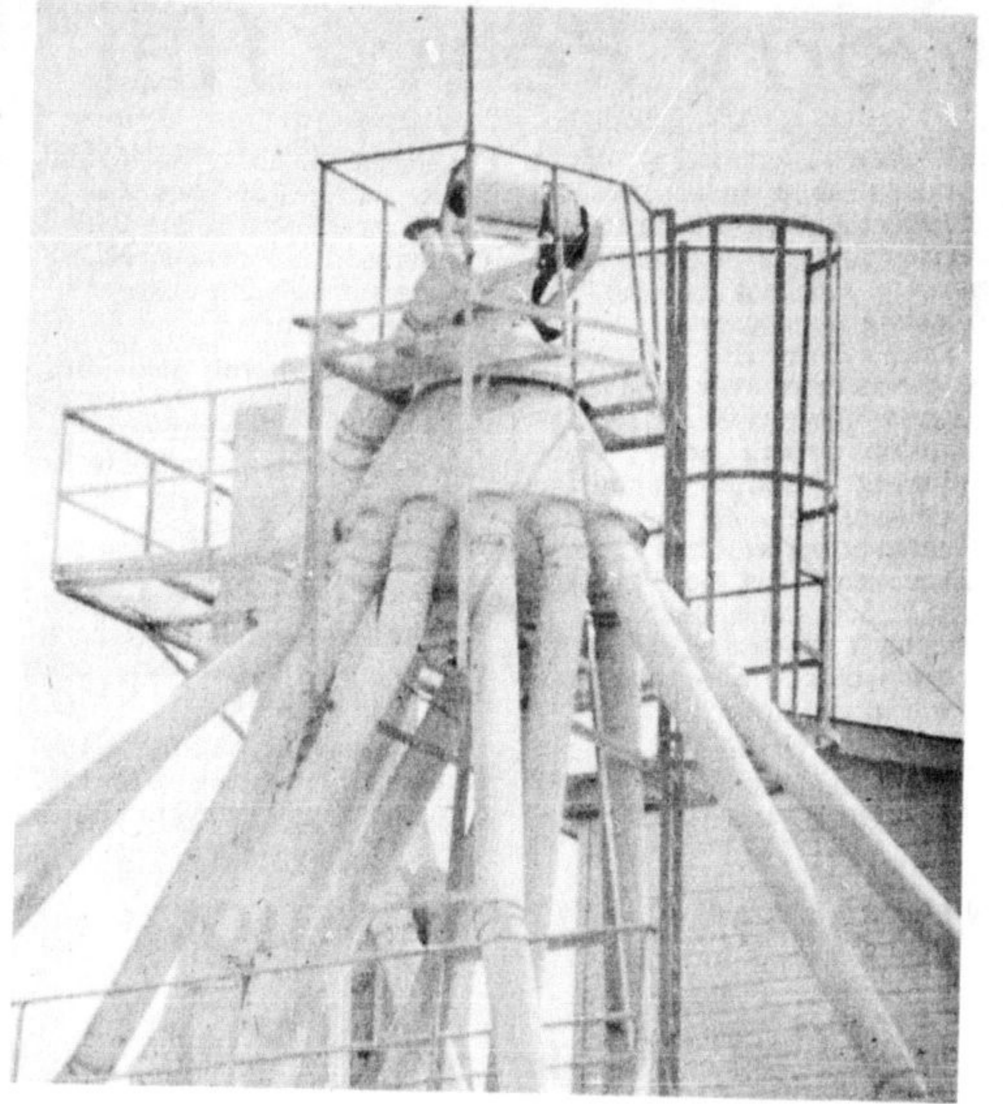
WHAT IS IT? Can you guess? It's a prominent landmark in the core of Milton, one you might pass by daily but you won't see it until you look awa-a-ay up high. Give up? It's a contraption atop the uppermost storey of the Robin Hood Multifoods mill on Martin St.—(Staff Photo)

Campbellville play in a tournament at Dorchester, Ontario this weekend, and are back home next Monday when they host Oakville.