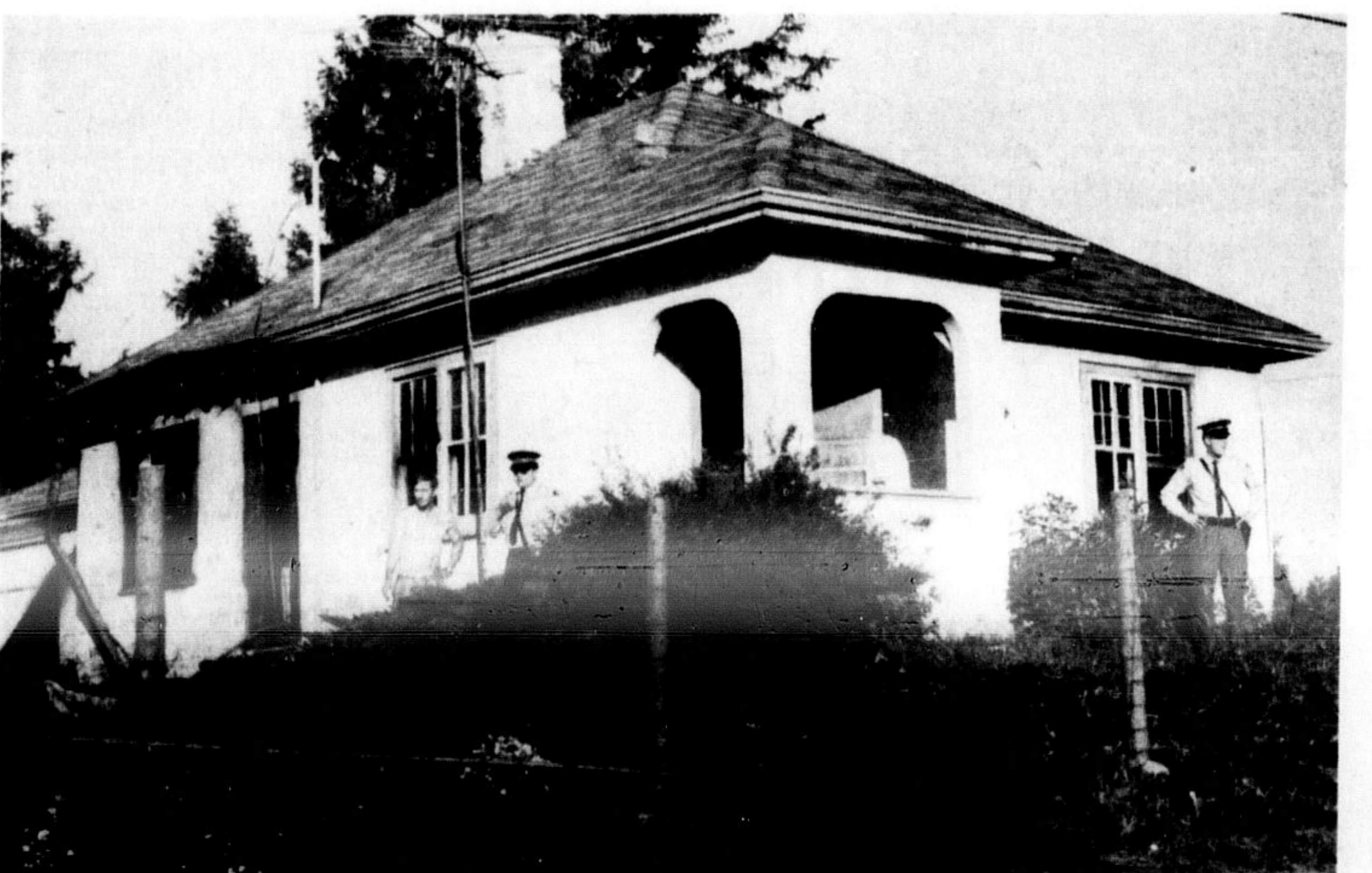
FOLLOWING the arrival of officers from the OPP identification branch in Burlington, two officers were stationed in front of the house to prevent entry of unauthorized persons.