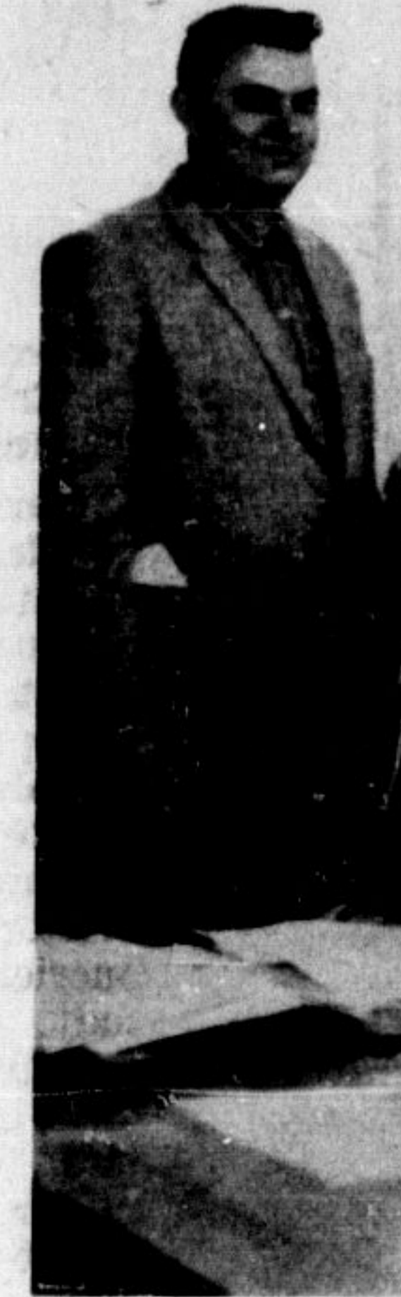
HALTON AGRIC elected Saturday are Honorary Pr Readhead, presi