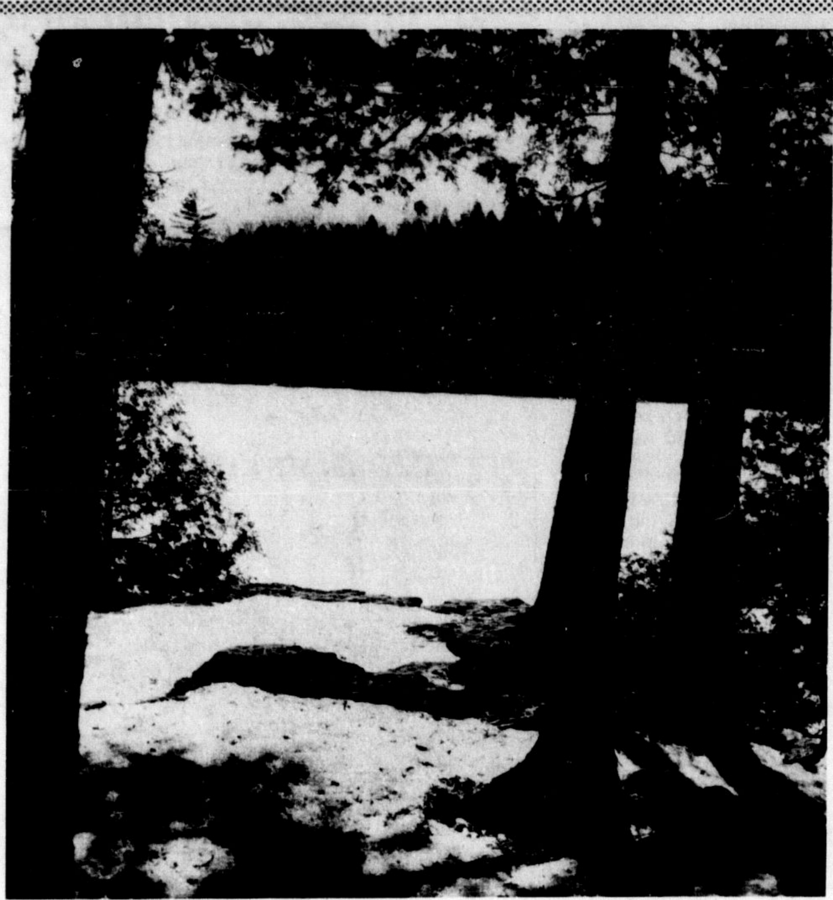
BLACK AND WHITE study in winter, Crawford Lake near Campbellville is "at rest" through the snowy months. A layer of snow has covered its surface and the sun breaks through a gap in the trees.