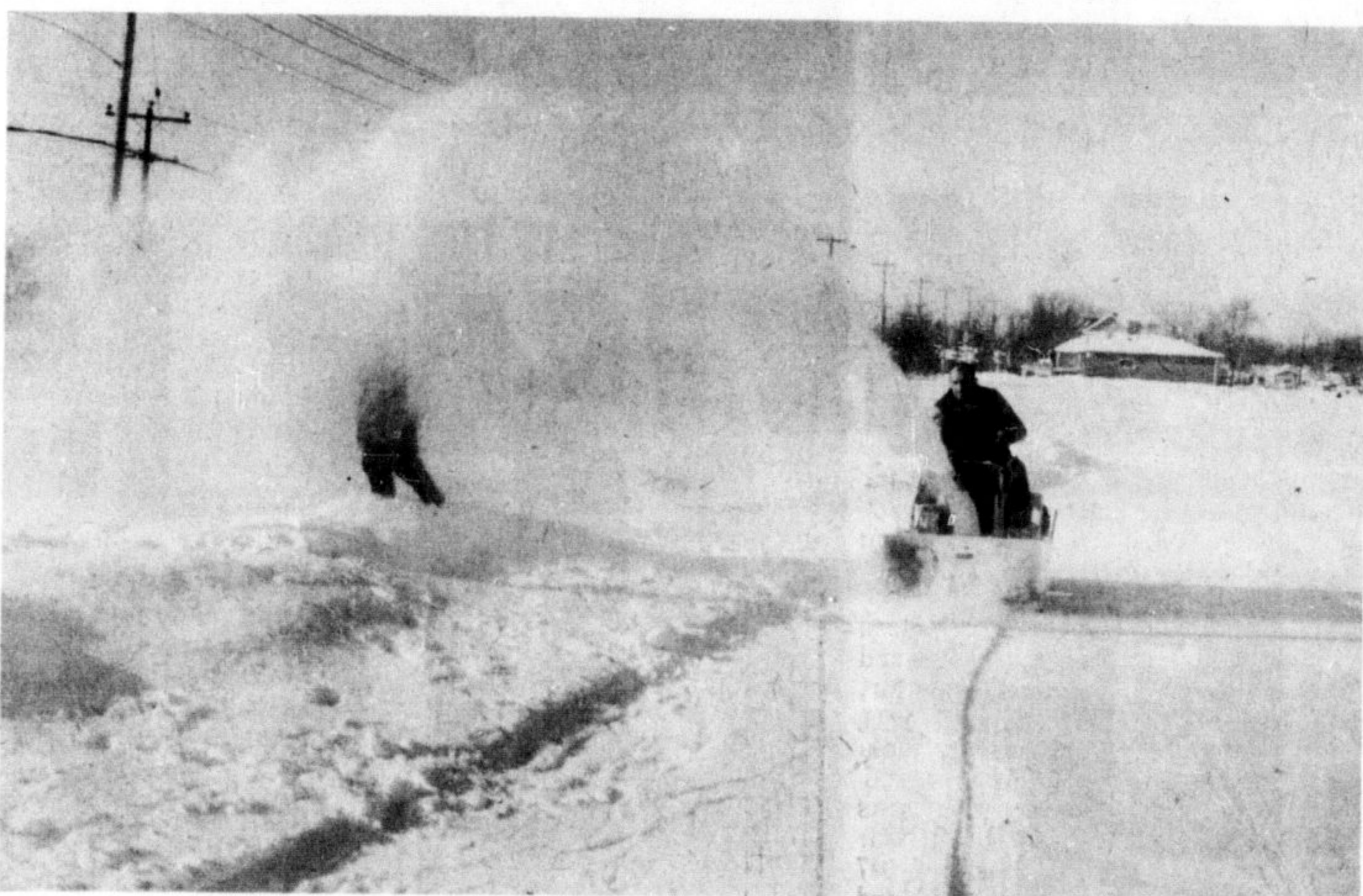
WHEN YOU'RE YOUNG, anything new is a challenge. So children skating on the frozen surface of a drainage pond at the corner of Heslop Rd. and Bronte St. found it was great

proceeds of the collection to Mrs. W. Isham, manageress at the North Halton Adult Rehabilitation Centre workshop for retarded adults a Hornby just before Christmas. In the foreground trainees work on Christmas tree ceramics they have been mass-producing in recent weeks.