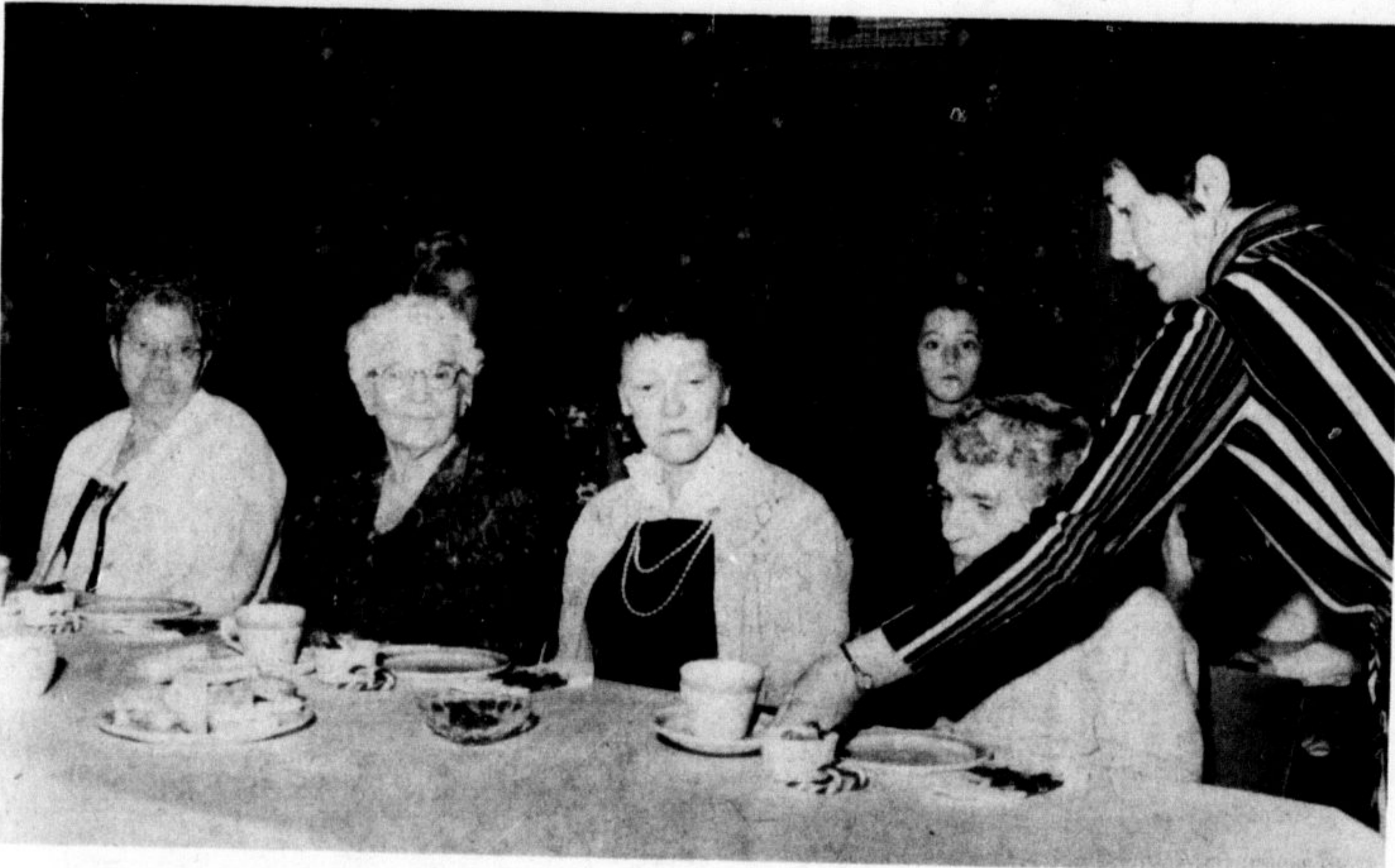
LADIES OF THE Catholic Women's League served senior citizens from Halton Centennial Manor Saturday at Holy Rosary Hall. The tea and cookies were followed by a well balanced afternoon of entertainment, provided by Holy Rosary students.