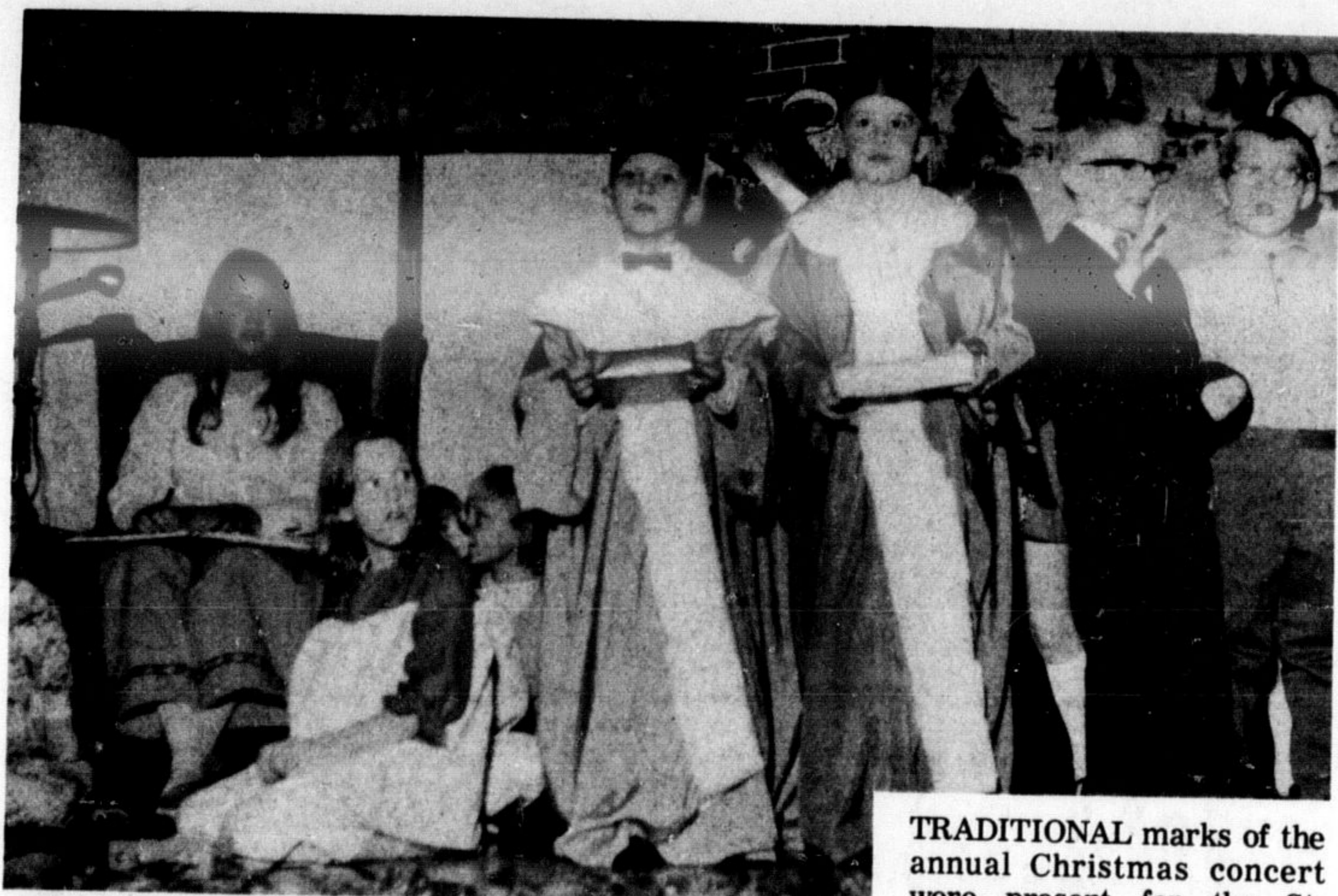
TRADITIONAL marks of the annual Christmas concert were present for the St. Paul's United Church Sunday School event last week. The Christmas story retelling was portrayed by the well-known figures seen on the stage above. A group of children were gathered for the story as wise men and shepherds, angels and choir added impact to the message. It was all capped off with a visit from Santa Claus as children confided their wishes and received their bag of goodies. About 150 attended the event in Graham Hall.