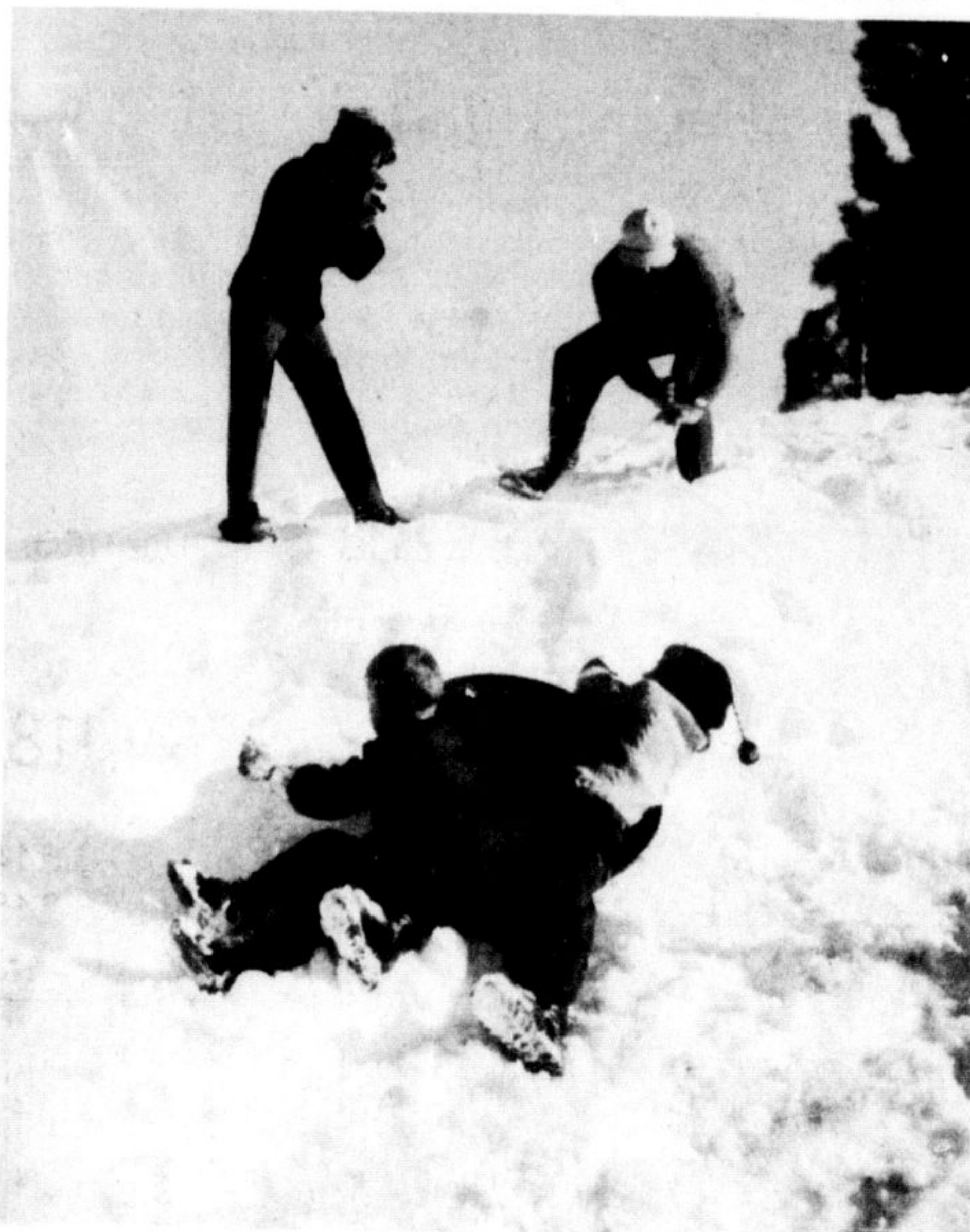
WHEE, THIS IS FUN. Wintry weather brought a heavy snowfall to Milton and district on the weekend, making it a great weekend for outdoor family fun.