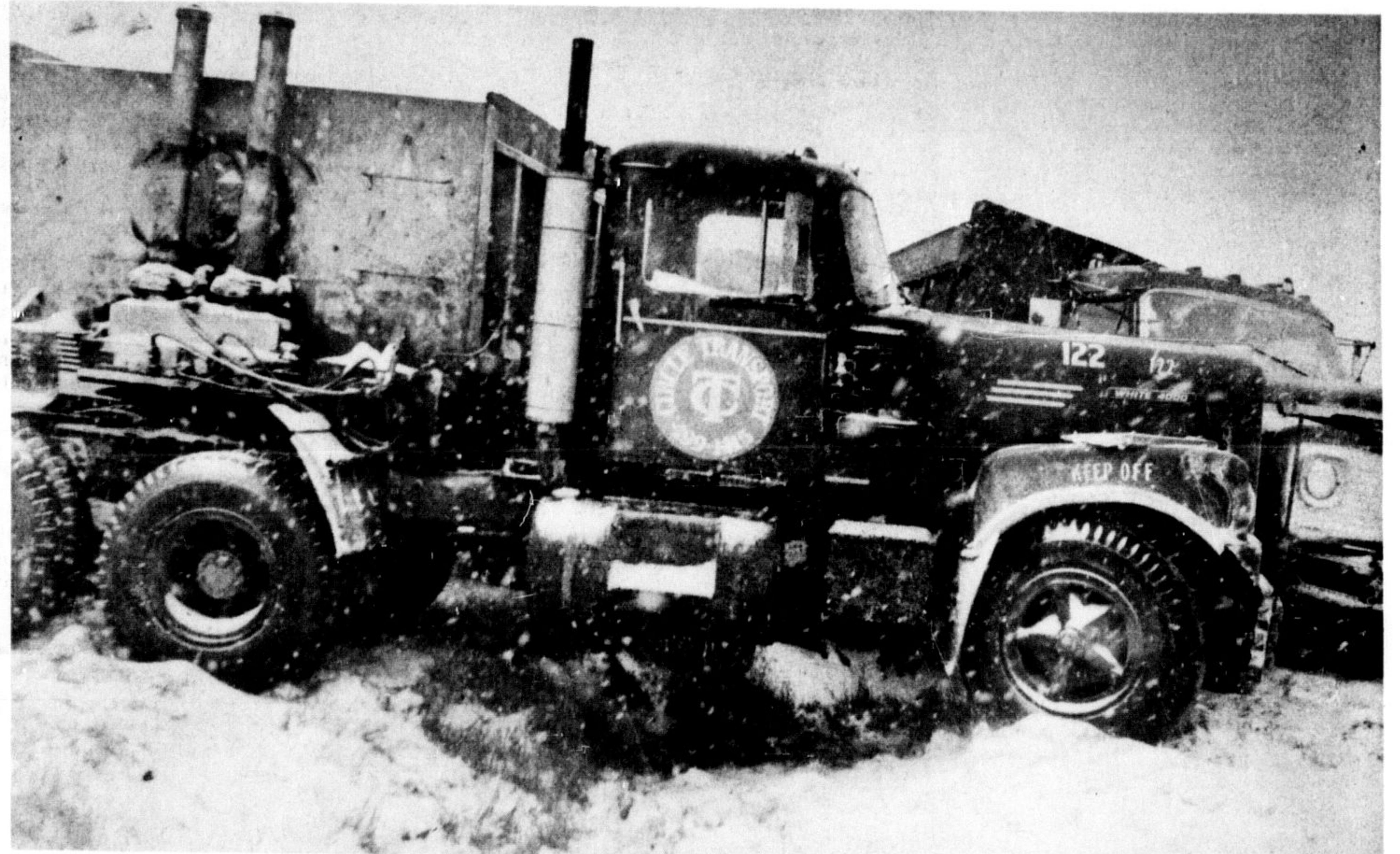
THE FIRST STORM of the season caused chaos on Highway 401 Friday morning. Several vehicles lost control on that highway and others in the area. This tractor trailer went off the road just half a mile from the scene of a second crash.

About 20 members of the Milton Rotary Club plan to take residents of Halton Centennial Manor on a car tour of the streets in Milton, so they can see the local Christmas lighting displays.