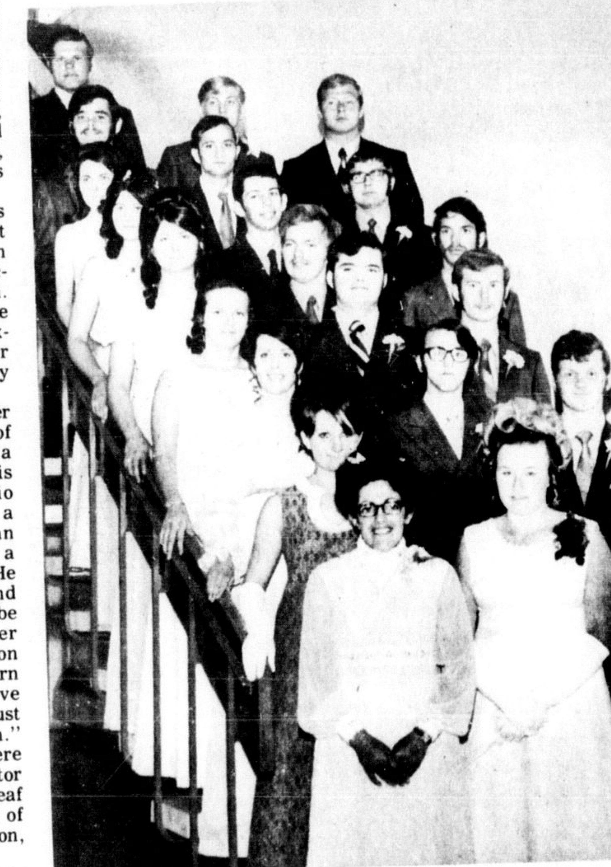
ONTARIO SCHOOL FOR THE DEAF'S 1970 graduating class included 21 students from various parts of western Ontario. They were honored at the annual graduation dinner at OSD on Friday evening, before heading out into a world of work and higher education.