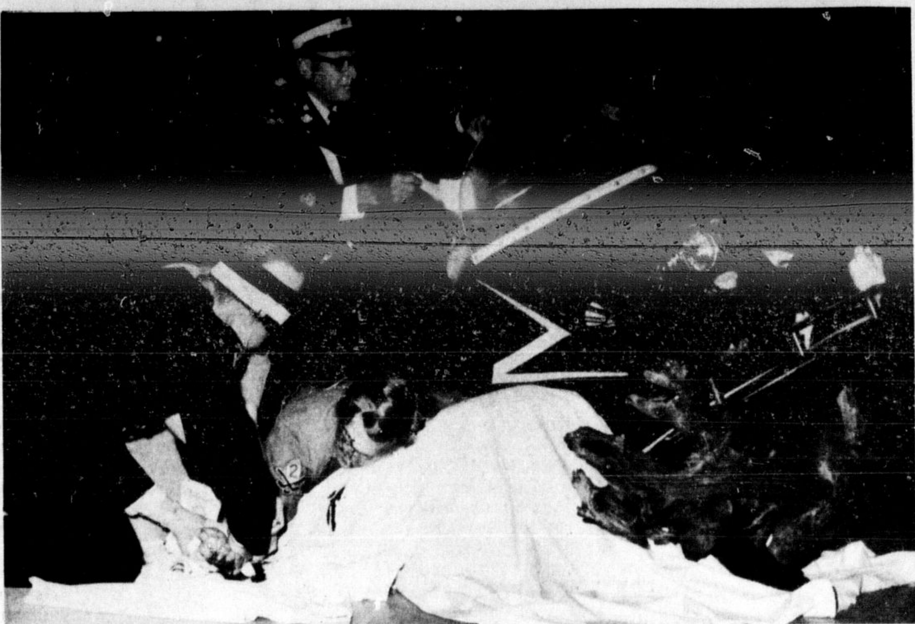
SNOWMOBILE ACCIDENT VICTIMS are given first aid by Oakville and Burlington St. John Ambulance brigades. The mock accident was staged at Milton arena Thursday evening illustrating how accident victims are aided by the ambulance brigades. Milton, Acton, Burlington, Oakville, Port Credit, Brampton and Malton brigades staged their own accident and demonstrated emergency methods of care before the victim is hospitalized.