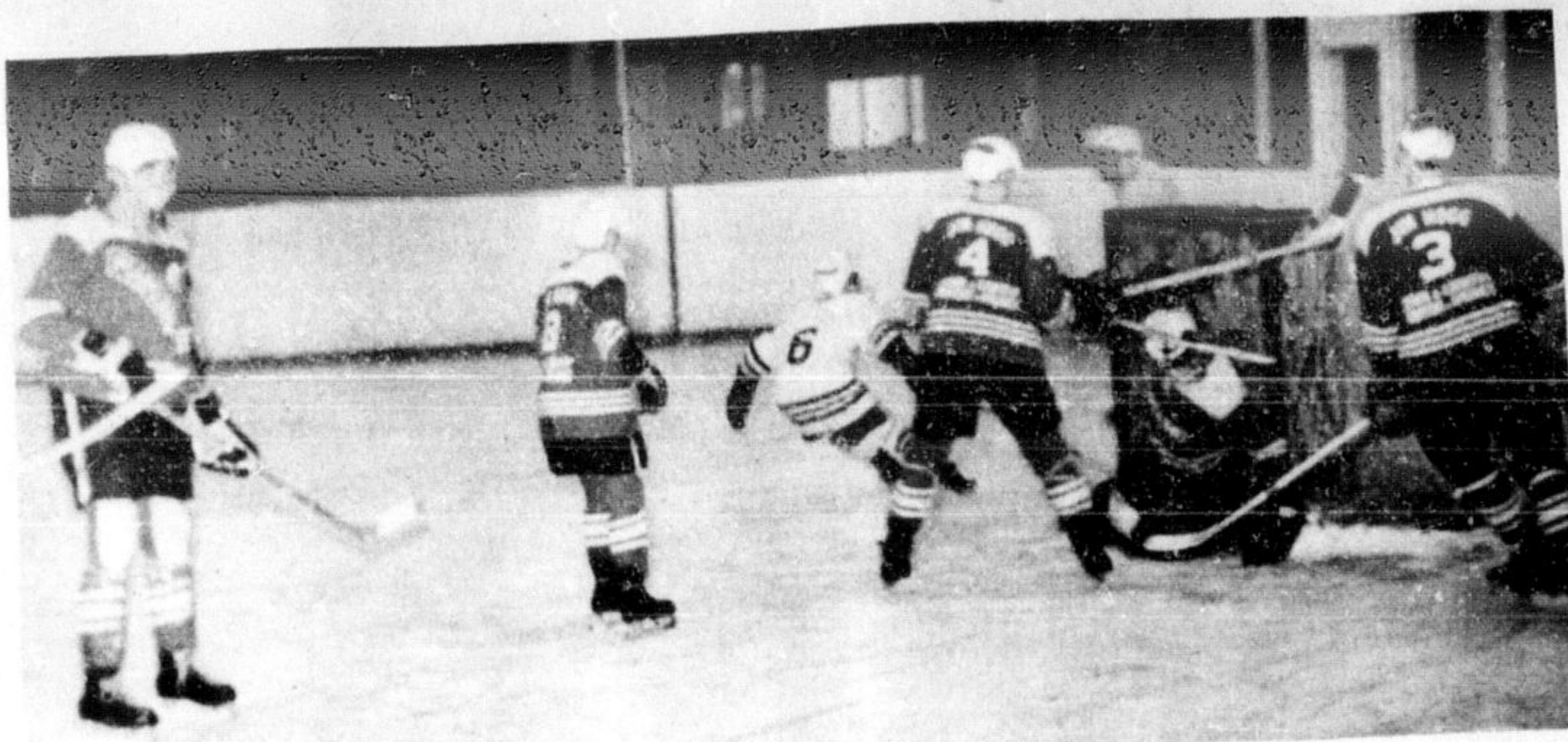
SO CLOSE BUT so far away. Hespeler goalie smother a loose puck as a Milton winger flies by. Milton score with nine seconds left to beat Hespeler and hang in for a third game in the Bantam playoffs.

Milton battled to a 4-4 tie with Oakville in the exhibition action warming up for series action.