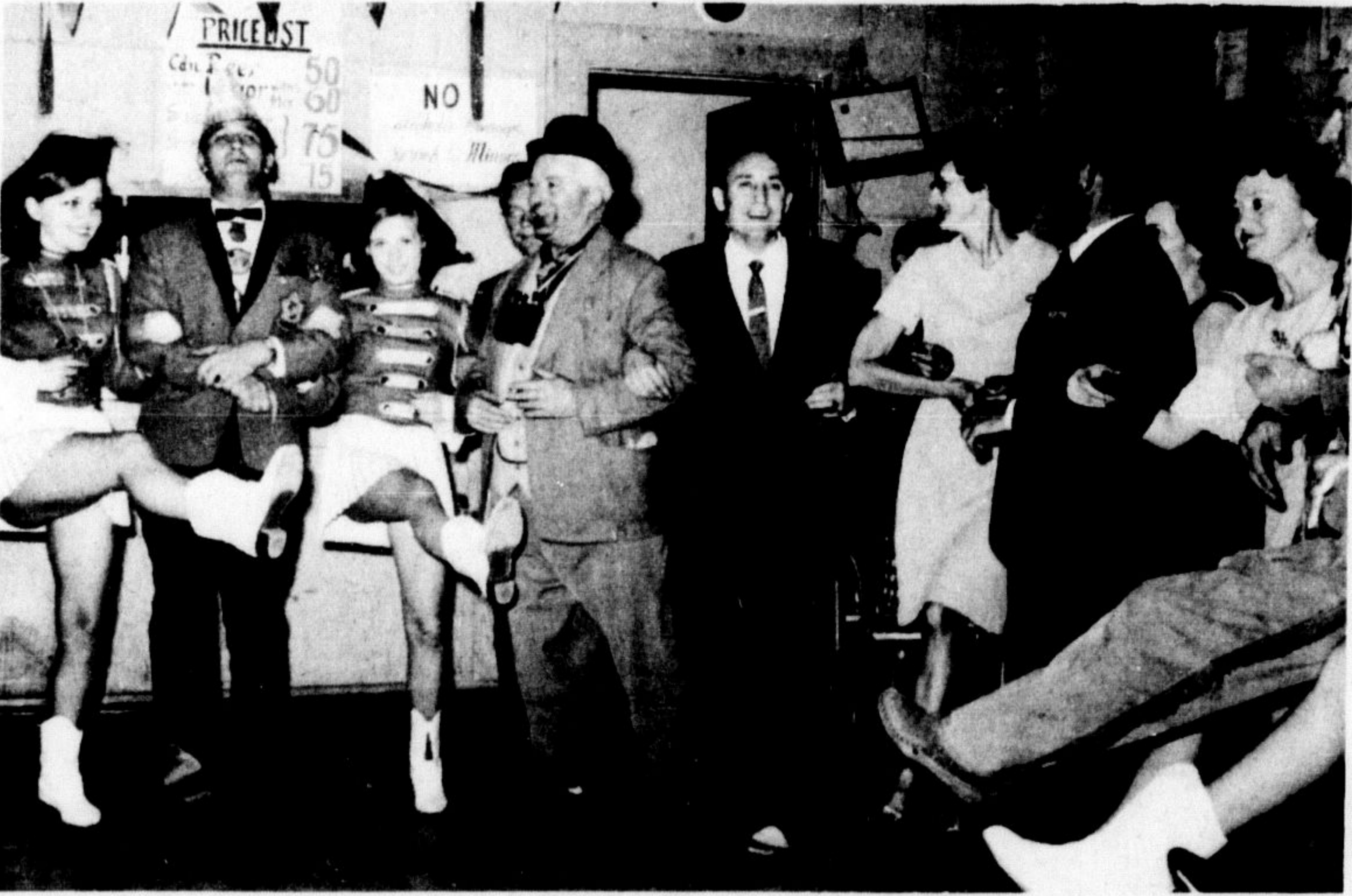
A KICK LINE formed quickly as the merrymakers at the Halton German-Canadian Club celebrated the entrance of their prince and princess of the

Council agreed to file the Esquering resolution and the Board reply.