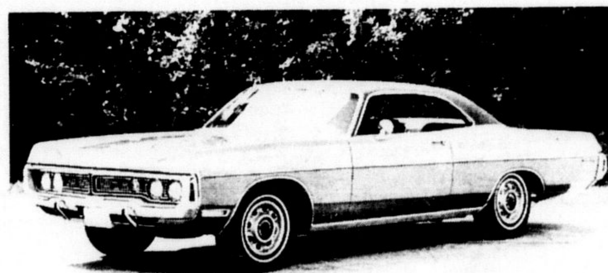
1970 DODGE POLARA CUSTOM TWO-DOOR HARDTOP