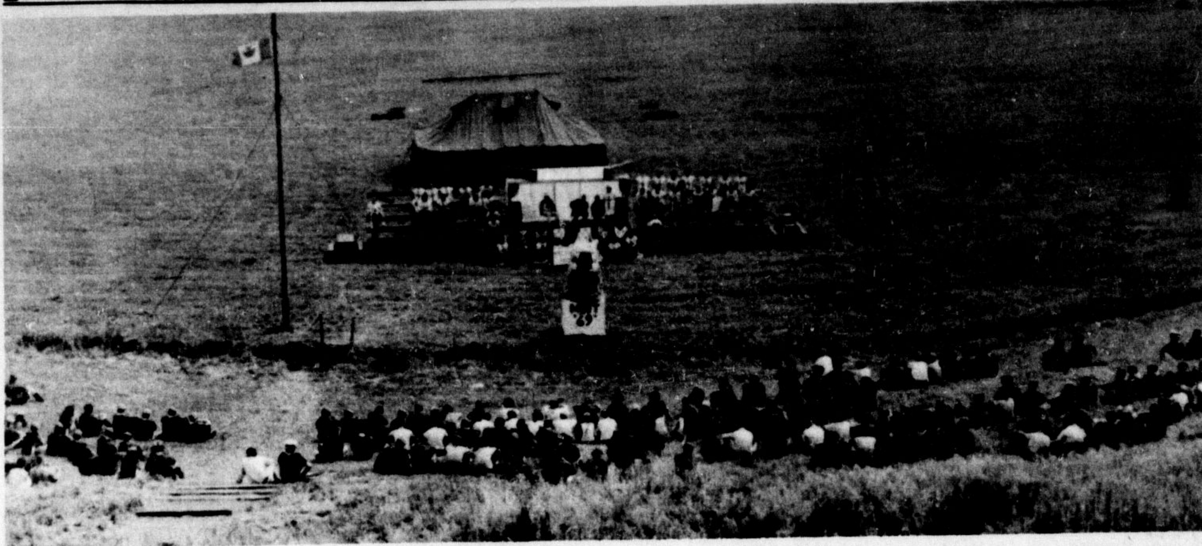
CEREMONIES at the Rover Moot held at Kelso on the Labor Day weekend were held at the base of this hill just below the main campsite on the northeast corner of the conservation area. Events such as these opening ceremonies went on all day and at night, the king's stand was converted into a stage and a talent show was held each evening which managed to last into the small hours of the morning.