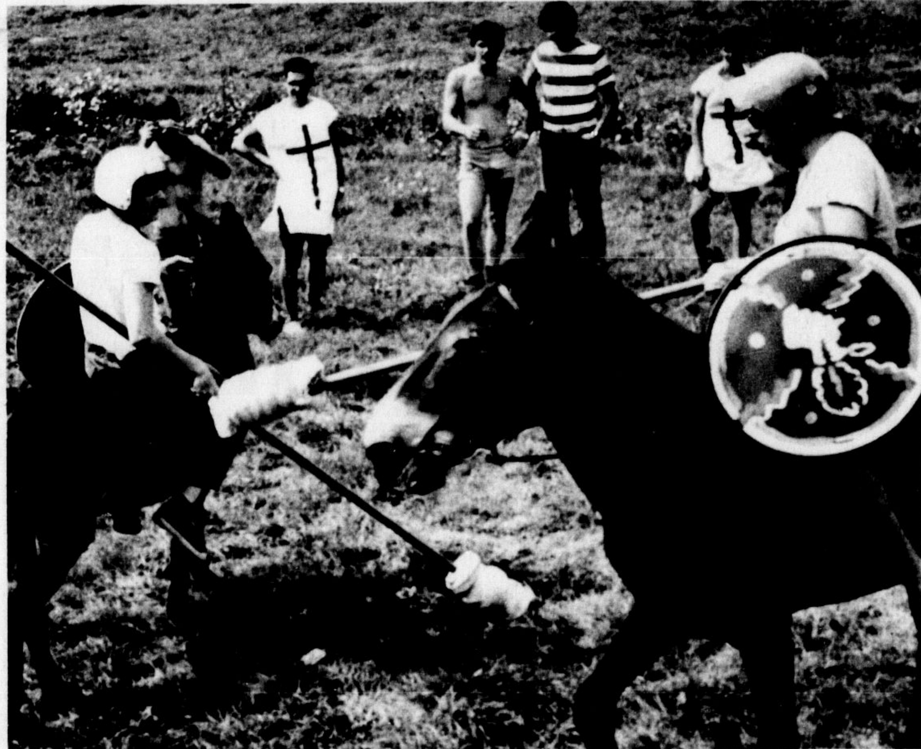
DONKEY JOUSTING is a take-off on the mediaeval sport of jousting when knights charged each other with lances and the only protection was offered by a suit of armor. "Knights" at Moot '69 had only the protection of a motorcycle crash helmet and foam-rubber tipped lances as they set

SUNDAY, SEPT. 7th, 1969 14th after Trinity 8:00 a.m.—Holy Communion. 9:30 a.m.—Matins and Sermon. 9:30 a.m.—Jr. Sunday School. 10:45 a.m.—Sr. Sunday School. 11:00 a.m.—Holy Eucharist and Sermon. Thursday, September 4th, 10 a.m. — Holy Communion. Please note the times of the regular services and the beginning of our Sunday School. You are Always Welcomed at Grace Church