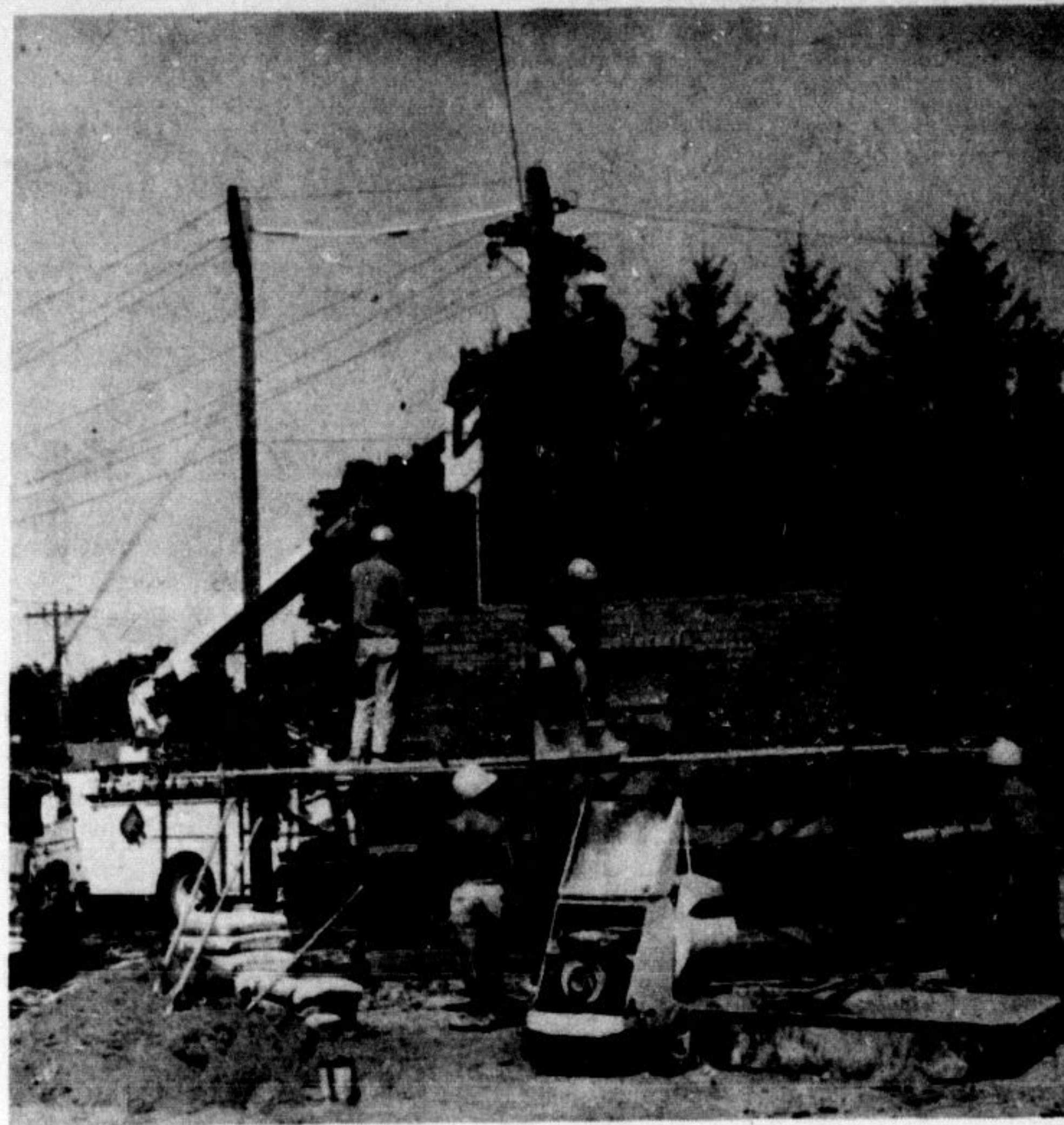
BEE HIVE OF ACTIVITY is the scene of the Robert St. pumping station as rebuilding progresses. Hydro workers are up the pole restoring service while bricklayers erect the building and electrical work continues inside the building. Completion was made by Tuesday evening following the early Sunday morning explosion that destroyed the first pump house.

Councillor P. Barr wondered if a start could not be made in installation of storm sewers to relieve the drainage from around basement tile now flowing into the sanitary sewers.