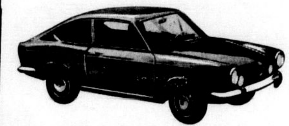
MODEL 850 FIAT COUPE