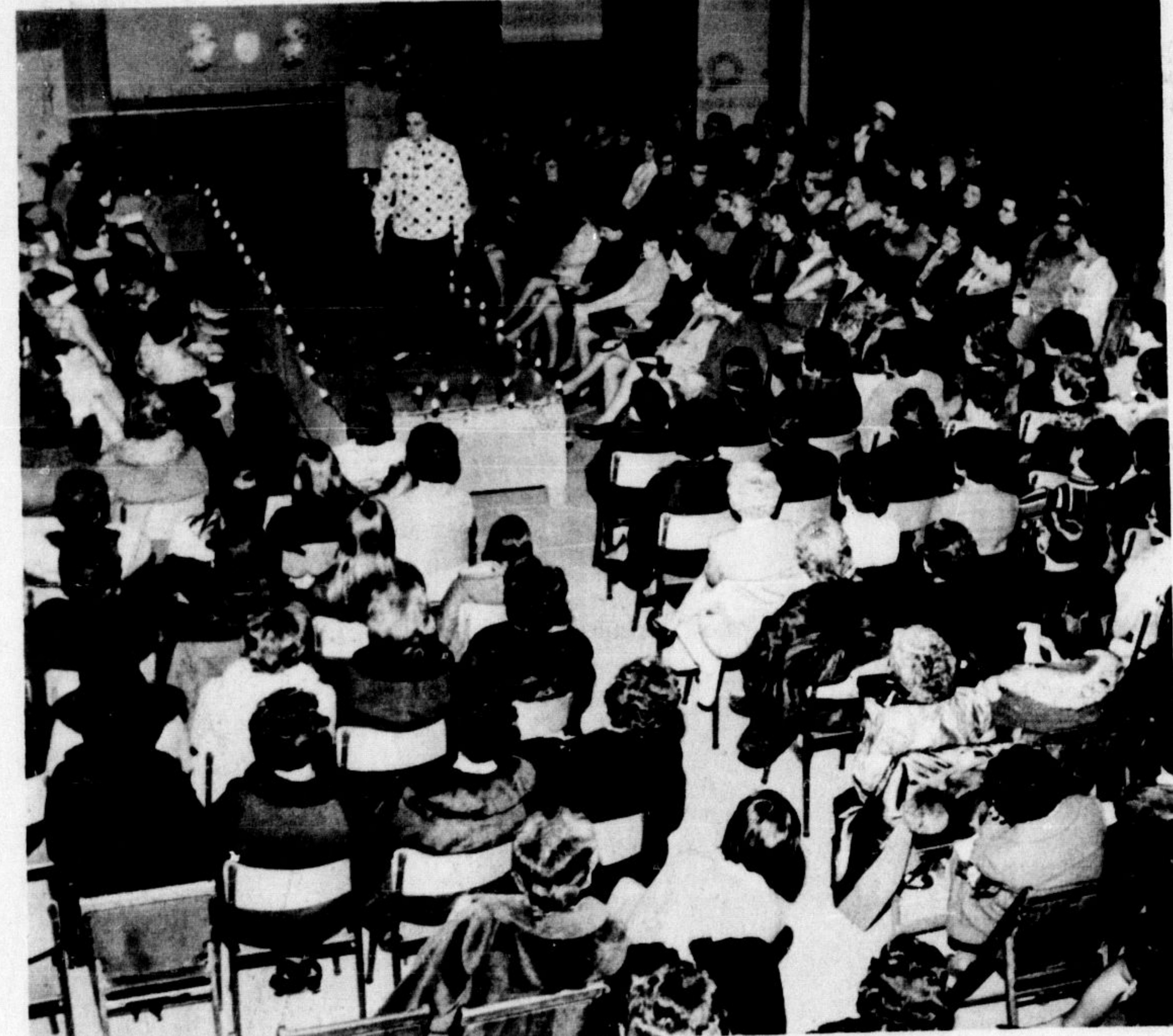
A SPRING FASHION SHOW sponsored by Holy Rosary Catholic Women's League drew a crowd of over 200 to a Holy Rosary Parish Hall on Wednesday evening, where six children and 11 adult models displayed a variety of spring wearing