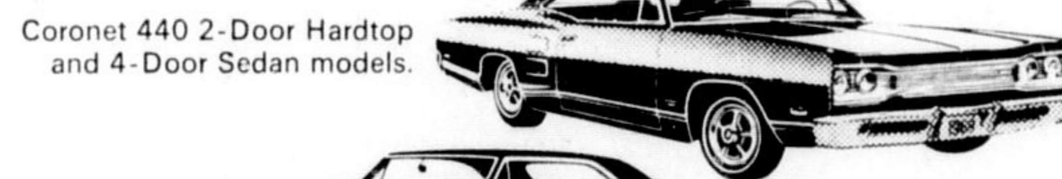
Coronet 440 2-Door Hardtop and 4-Door Sedan models.