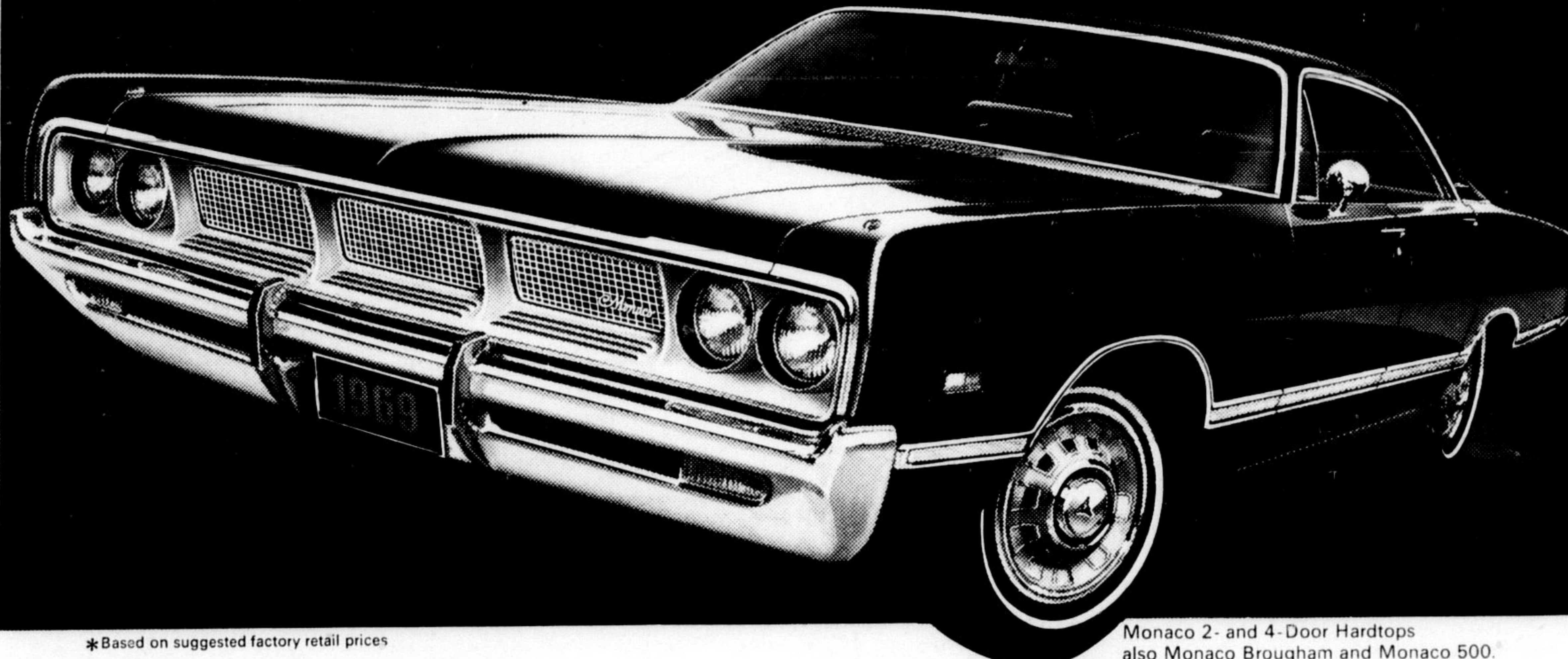
Monaco 2- and 4-Door Hardtops also Monaco Brougham and Monaco 500.

We take a Dodge. Add the extras most people want. Then cut the price on these extras up to 45%*. And give it a name... DODGE WHITE HAT SPECIAL.