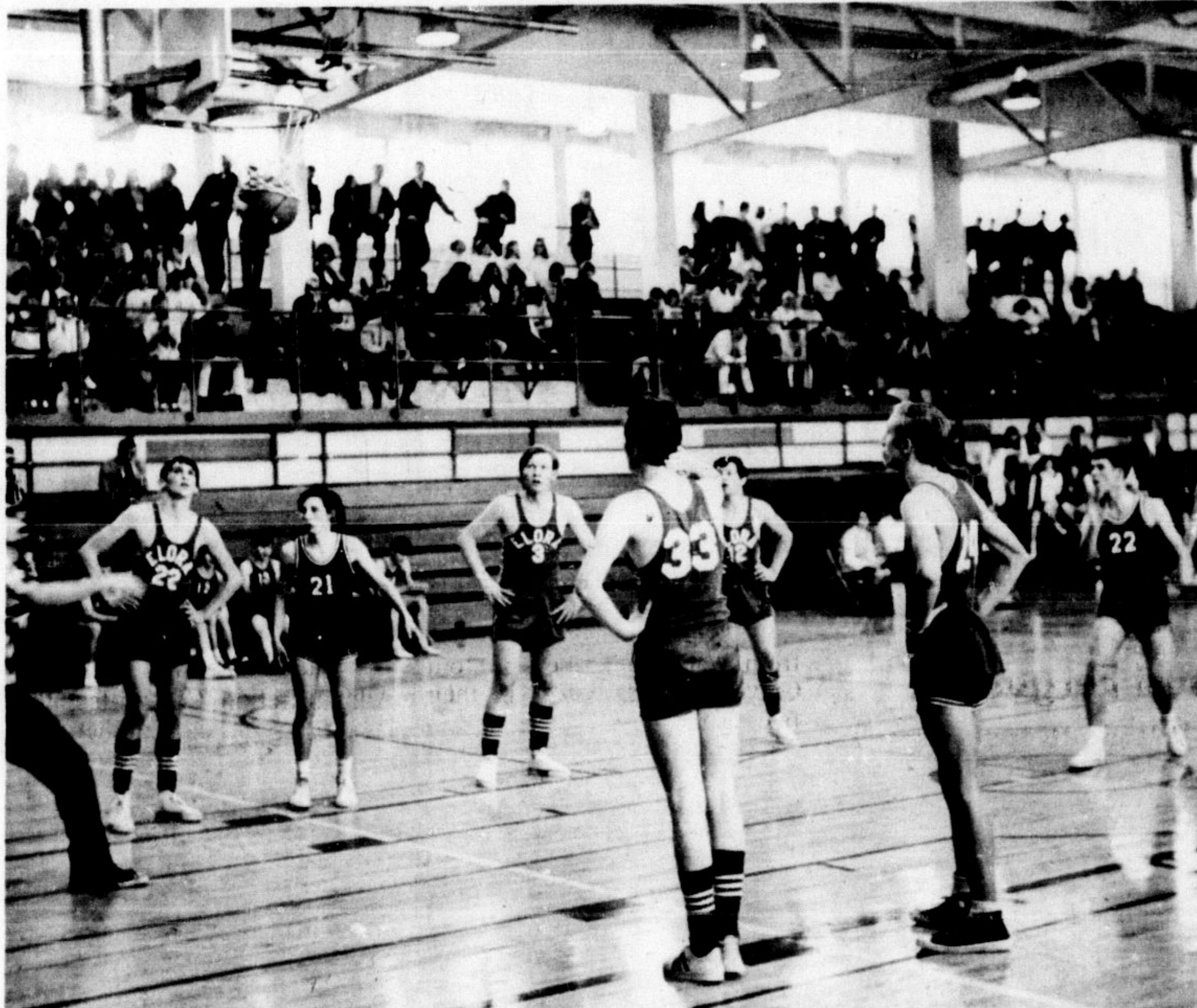
IT'S IN THE BASKET and Warton High's junior basketball team chalks up another point during their tournament playoff with Elora. Ontario School for the Deaf hosted the CWOSSA "B" tournament in Milton Saturday and boys' and girls' junior and senior winners were selected to go on into Ontario playdowns. The two gymnasiums at O.S.D. were busy all day long as teams from district centres fought for the titles. O.S.D. entered two teams for exhibition games.