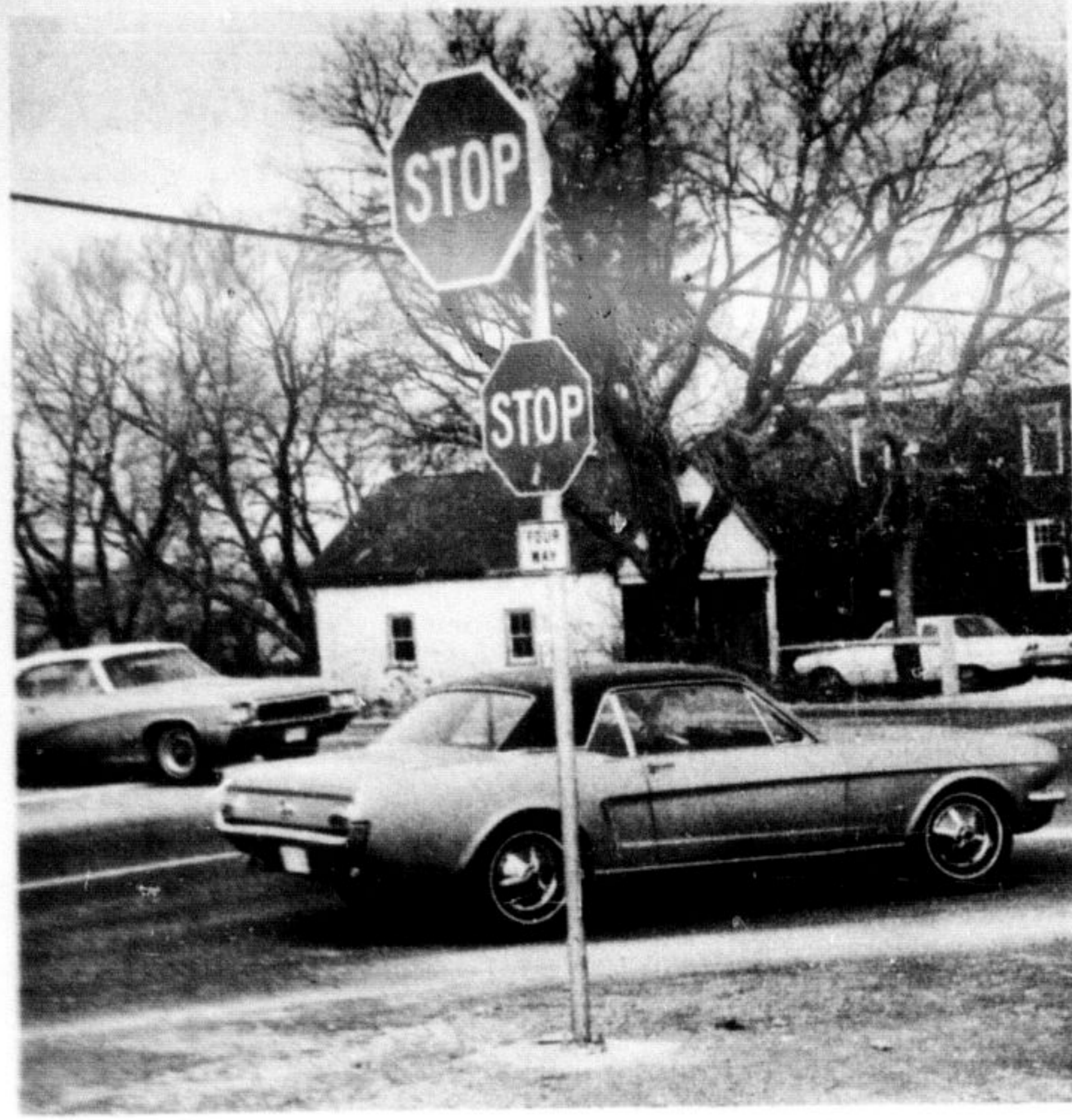
WATCH OUT FOR THIS . . . A four-way stop is in effect at the intersection of Base Line and Trafalgar Road, Hornby, where the new Hornby diversion road curves north-westerly from the intersection. Flashing red stop signs (top) have been placed on the Base Line to alert motorists to the change in regulations.