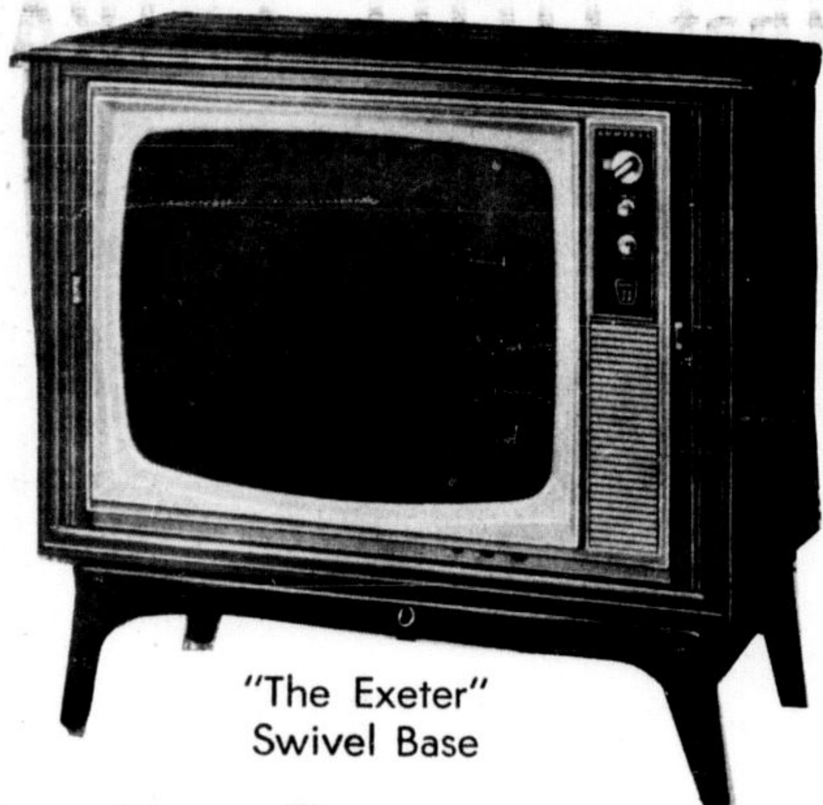
"The Exeter" Swivel Base

23" BLACK & WHITE INSTANT PLAY BY ADMIRAL