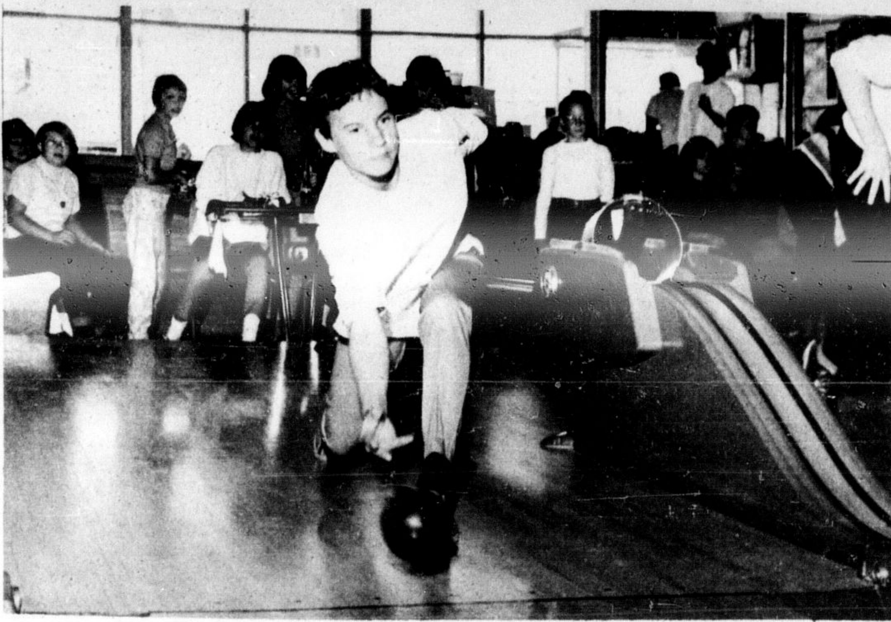
ONE YOUNG YOUTH BOWLER lets fly with a ball during Saturday's fun at Milton Bowlway. To date about 50 have signed up for the sport this winter, and more are welcome. Cost is $1.50 registration (of which 50 cents is paid by the bowlway) plus the regular two games each week. Children aged seven and over are invited to join the fun.